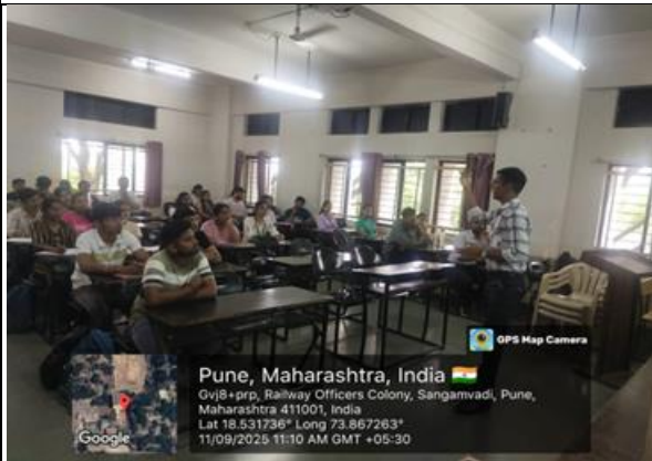
EXPERT SESSION ON "ANSYS SOFTWARE" 11/09/2025