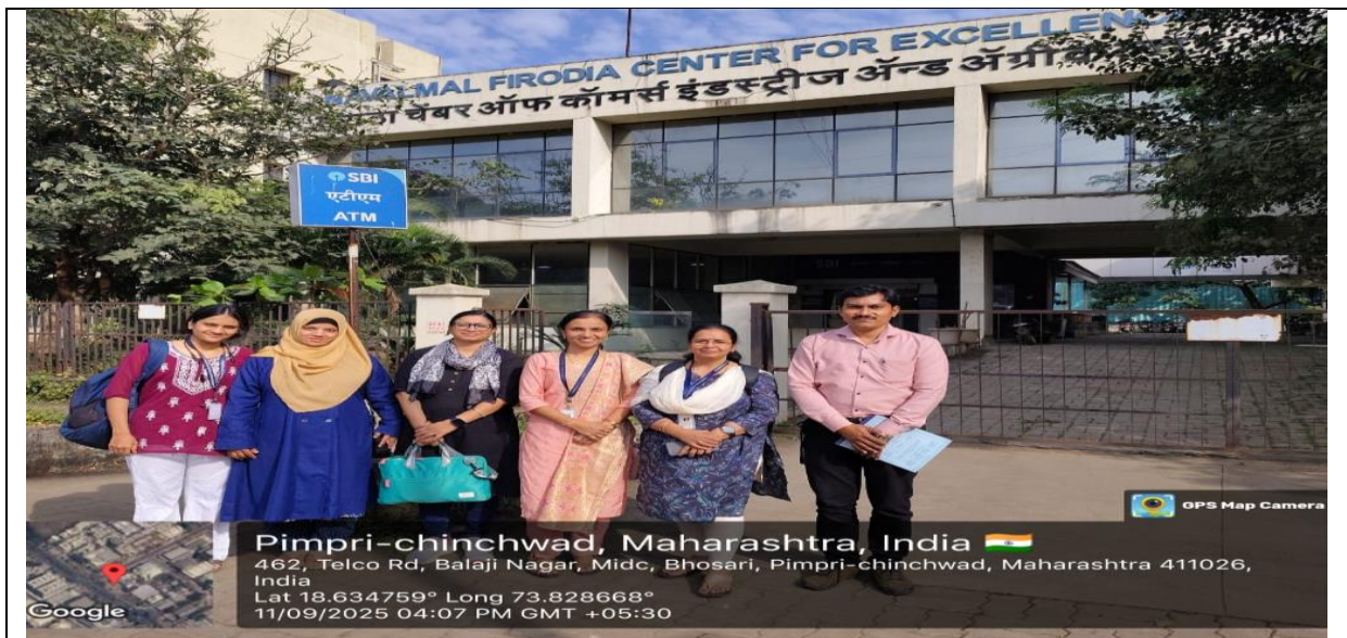
Industry Academic Interaction Part of MH-6 Workshop conducted by NITTTR , Bhopal Extension Centre Pune on 11/09/2025