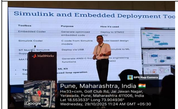
Pune, Maharashtra, India Hw33+cxm, Golf Club Rd, Jai Jawan Nagar, Yerawade, Pune, Maharashtra 411006, India Lat 18.53533° Long 73.904936° Wednesday, 29/10/2025 11:24 AM GMT +05:30