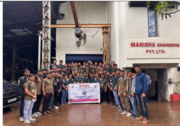
Industrial Visit to Manisha Engineers Pvt.Ltd on 15/9/2025 , TY Btech Electrical