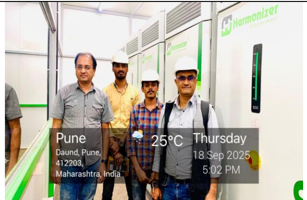
PQ Audit Hands-on Experience at Western Metal Bhandgaon 18/09/2025