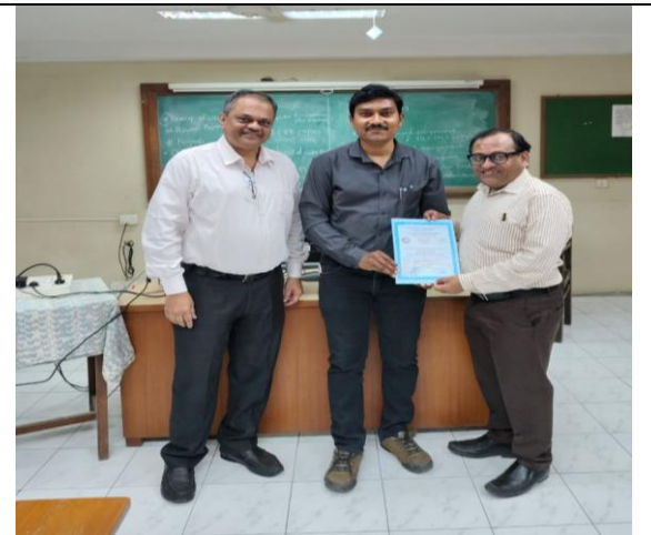
MH-06 FDP on “ Case Studies, Micro Projects, and assignments Development with Assessment”NITTTR , Bhopal Extension centre pune during 08/09/2025 to 11/09/2025