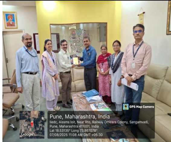
MoU Signing with Founder of Shriman Ecocycle Pvt.Limited