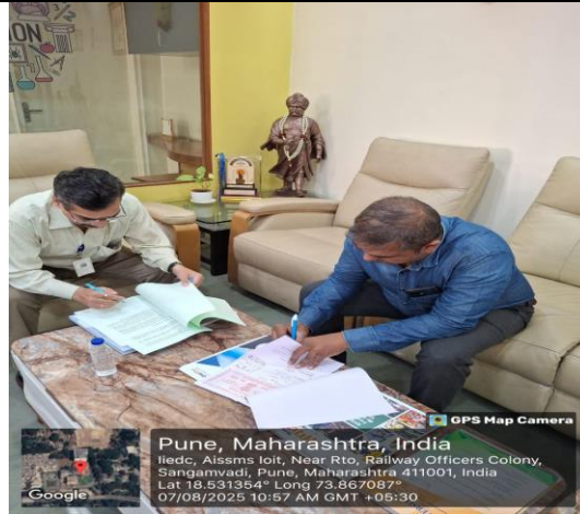
MoU Signing with Founder of Shriman Ecocycle Pvt.Limited