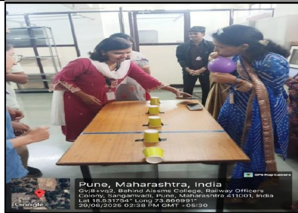
Squid games, 29/08/2025