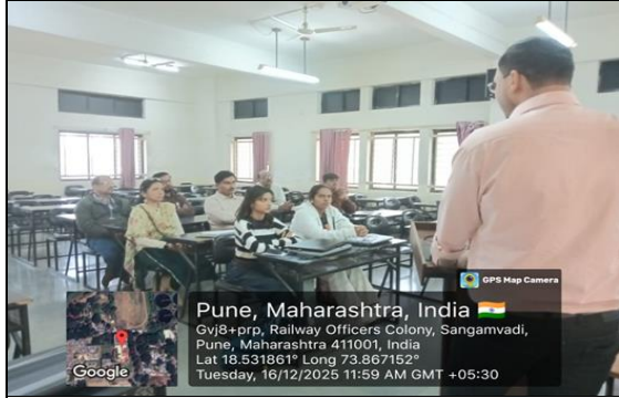
Pune, Maharashtra, India Gvj8+prp, Railway Officers Colony, Sangamvadi, Pune, Maharashtra 411001, India Lat 18.531861° Long 73.867152° Tuesday, 16/12/2025 11:59 AM GMT +05:30