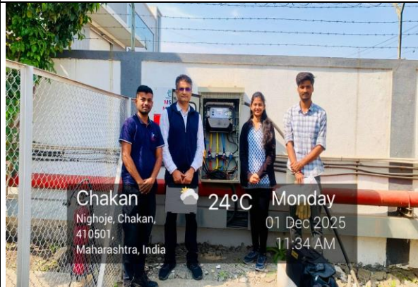
PQ Audit Hands-on Experience at Bosch Chakan 01/12/2025