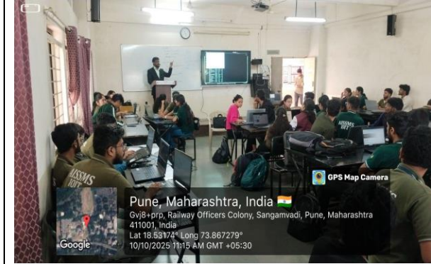
Pune, Maharashtra, India Gvj8+prp, Railway Officers Colony, Sangamvadi, Pune, Maharashtra 411001, India Lat 18.53174° Long 73.867279° 10/10/2025 11:15 AM GMT +05:30