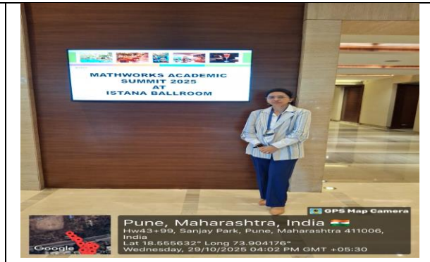
Pune, Maharashtra, India Hw43+99, Sanjay Park, Pune, Maharashtra 411006, India Lat 18.558632° Long 73.904176° Wednesday, 29/10/2025 04:02 PM GMT +05:30