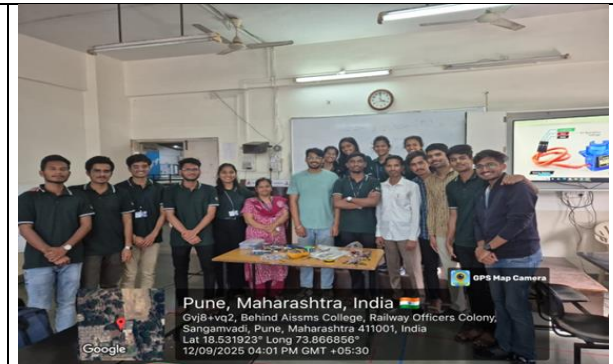
Two Days Hands on Workshop on ElectroVision Designing and Building Circuits 11/09/2025 & 12/09/2025