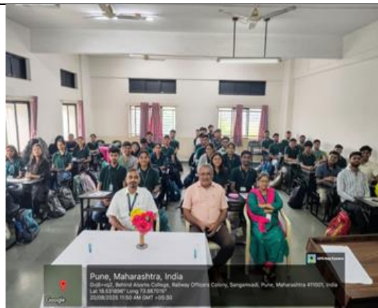
AKSHAY URJA DIWAS CELEBRATION -20/08/2025