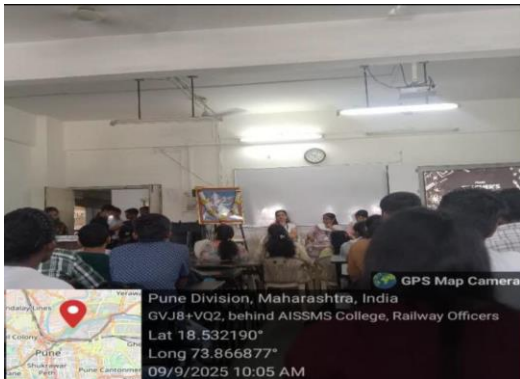
Teachers' Day Celebration, 09/09/2025