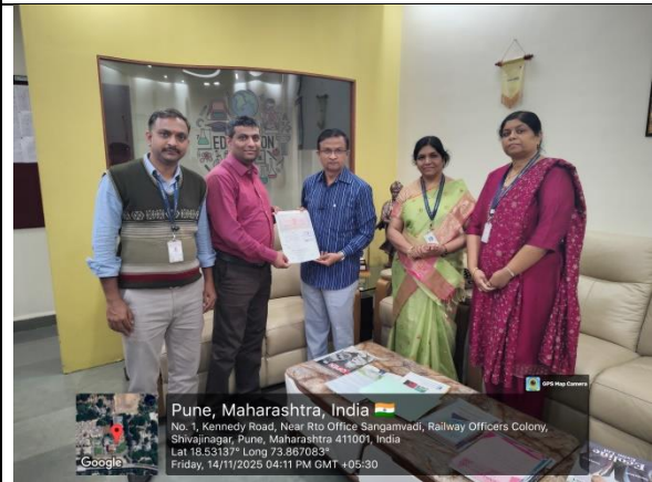
MoU Signing with Cyber Sanskar Pvt.Limited Nashik on 14/11/2025