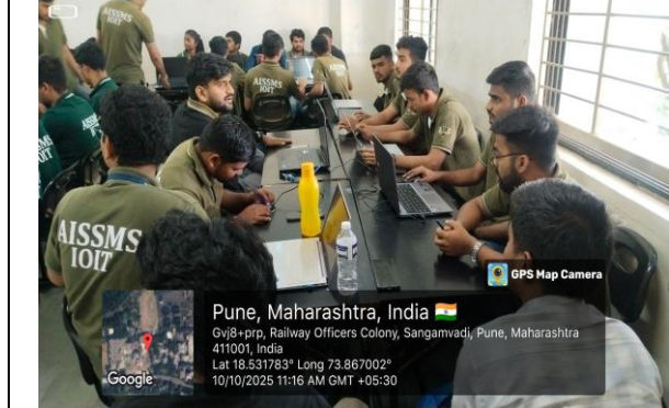
Pune, Maharashtra, India Gvj8+prp, Railway Officers Colony, Sangamvadi, Pune, Maharashtra 411001, India Lat 18.531783° Long 73.867002° 10/10/2025 11:16 AM GMT +05:30