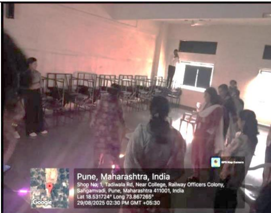
Electro Musical Chair, 29/08/2025