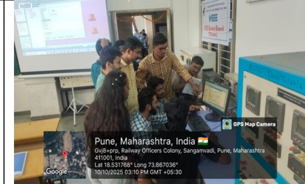
Pune, Maharashtra, India Gvj8+prp, Railway Officers Colony, Sangamvadi, Pune, Maharashtra 411001, India Lat 18.531768° Long 73.867036° 10/10/2025 03:10 PM GMT +05:30