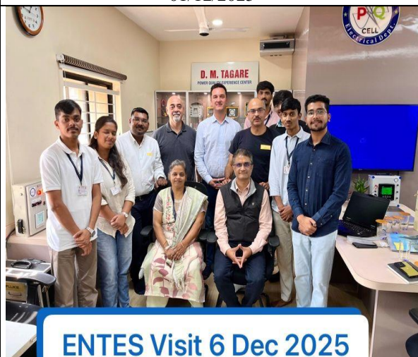
ENTES Visit 6 Dec 2025 Visit of ENTES Elektronik Turkey and ENTES India team to PQ Cell 06/12/2025