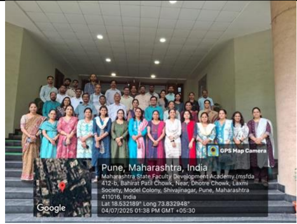
Participated in FDP, “Exploring Multidisciplinary: What, Why and How” Organized by Maharashtra State Faculty Development Academy- MSFDA