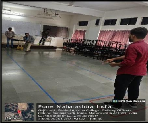
Arena Cricket, 29/08/2025