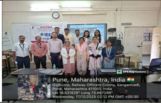
Pune, Maharashtra, India Gvj8+prp, Railway Officers Colony, Sangamvadi, Pune, Maharashtra 411001, India Lat 18.531828° Long 73.867286° Wednesday, 17/12/2025 02:12 PM GMT +05:30