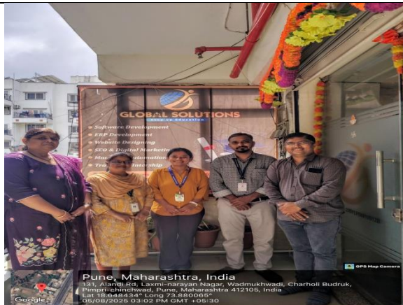
Industry connect with Global Solutions, Alandi, Pune on 05/08/2025