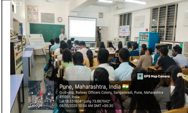
Pune, Maharashtra, India Gvj8+prp, Railway Officers Colony, Sangamvadi, Pune, Maharashtra 411001, India Lat 18.531804° Long 73.867042° 08/10/2025 10:54 AM GMT +05:30