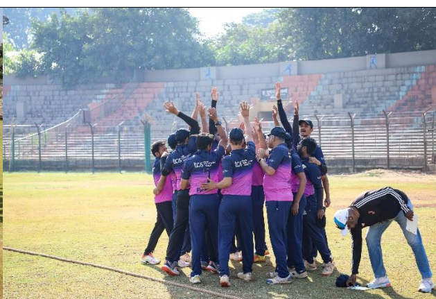
EVENT GLIMPSES [PHOTO 6]