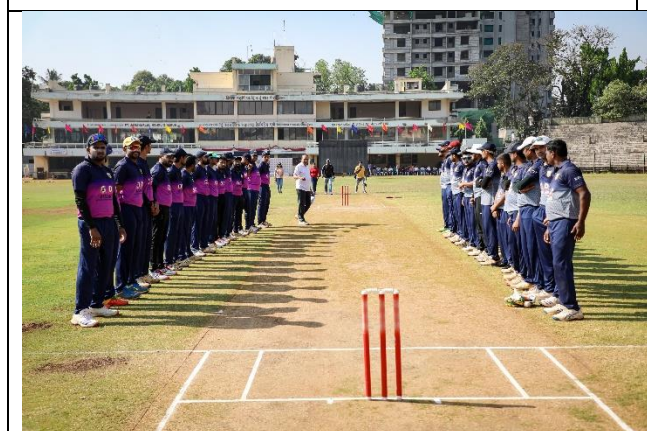
EVENT GLIMPSES [PHOTO 5]