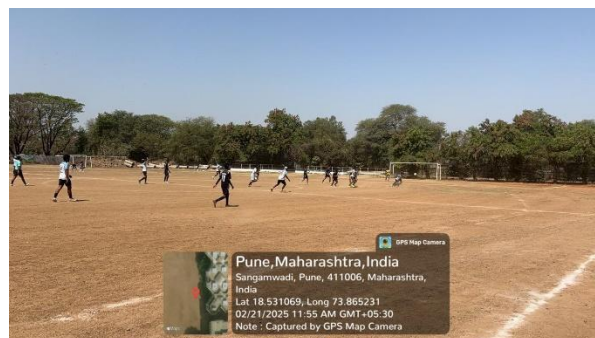
EVENT GLIMPSES [PHOTO 2] NORMAL PHOTO