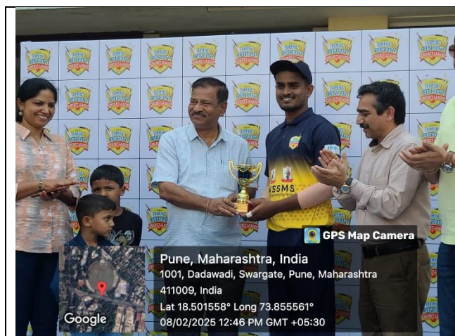
EVENT GLIMPSES [PHOTO 1] - GEOTAG