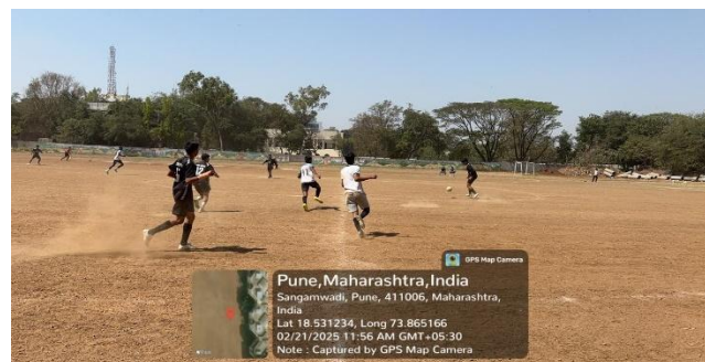
EVENT GLIMPSES [PHOTO 1]- GEOTAG