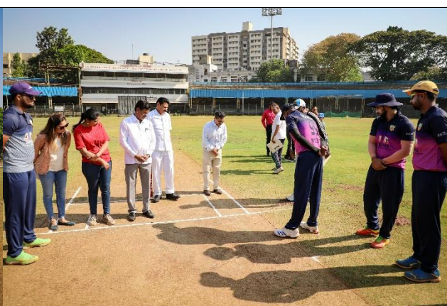
EVENT GLIMPSES [PHOTO 4]