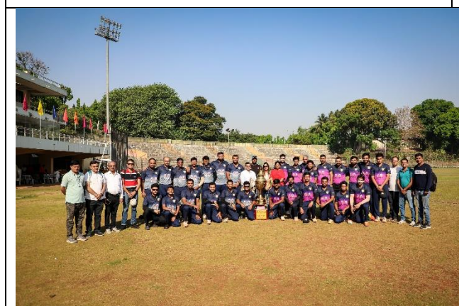
EVENT GLIMPSES [PHOTO 3]