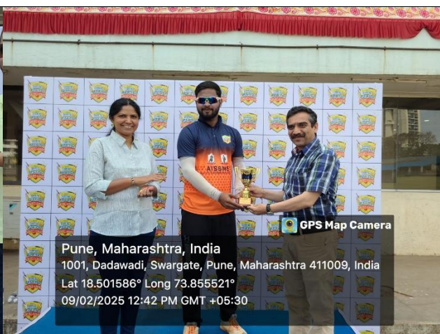
EVENT GLIMPSES [PHOTO 2] - GEOTAG