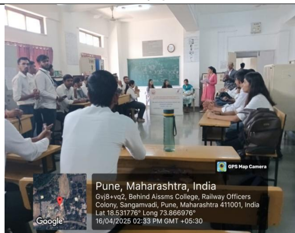
Valedictory function of Technokratia 2025 Project competition