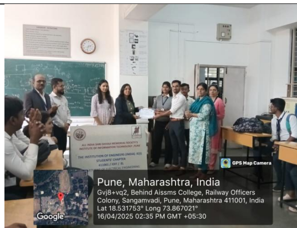
Best project group prize being given by judges and HoD at Technokratia 2025 .