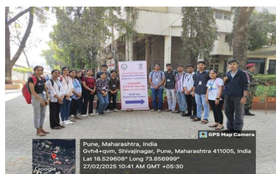
PQ Club members at MERC E-Hearing at COEP (27/02/2025)