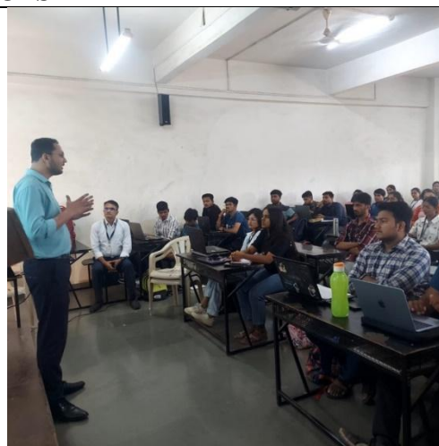
1 day hands-on training workshop on "Residential Wiring Design using AUTOCAD" for TY Btech on 15 th Apr. 2025