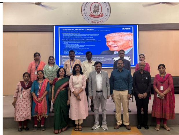
The Electrical Engineering department in association with PES_IAS Chapter of IEEE Pune Section conducted “The Fourth D.M.Tagare Memorial Lecture” on “Business and Technology Under Emerging Challenges on 27th Mar. 2025.