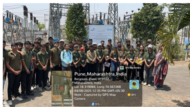
Industrial Visit to 50 MW, Solar Power Plant, Shirsuphal, Baramati, Pune on 8 th April 2025