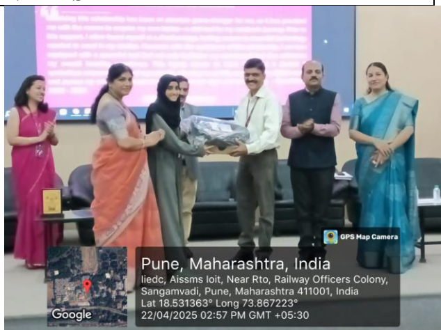
IEEE Women in Engineering Scholarship 2024-25, Laptop Distribution Event for shortlisted female students from Maharashtra funded by Quest Global was held on 22nd Apr. 2025 at our institute.