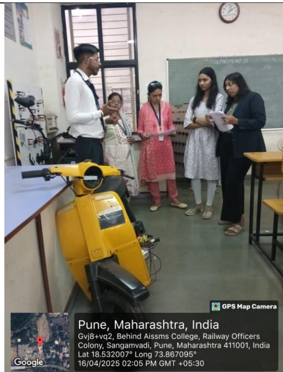
Internal and external evaluators evaluating a project in project competition Technokratia 2025