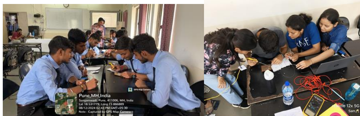
Two Days Workshop on Industrial Approach of Electrical and Electronic circuits on 12/08/2024 and 13/08/2024