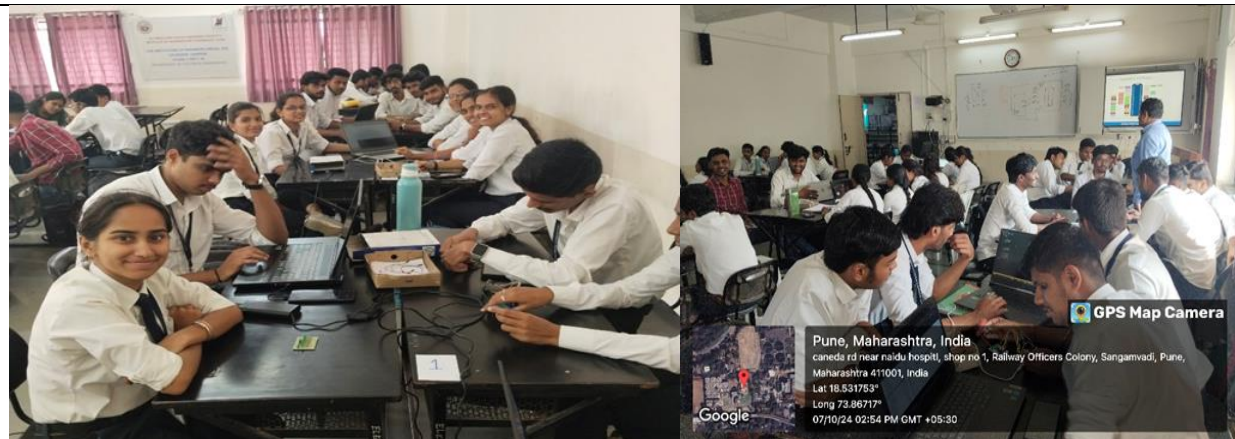
3 Days hands on training workshop on “Internet of Things (IoT)” for TY Electrical during 07.10.2024 to 09.10.2024