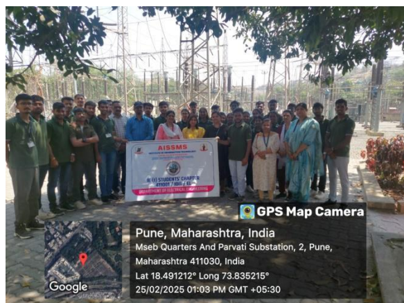
Industrial Visit to 220 KV Parvati Substation on 25 th Feb. 2025