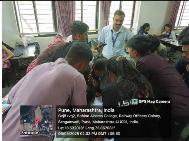
5-S Group Activity