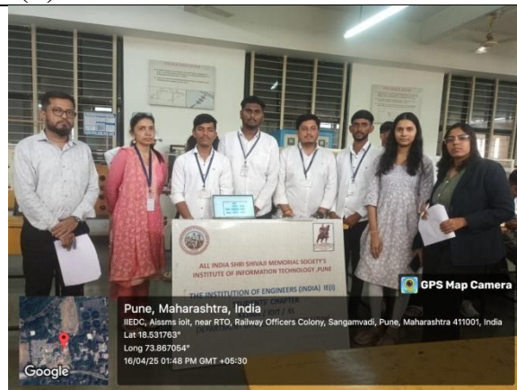
Internal and external evaluators evaluating a project in project competition Technokratia 2025