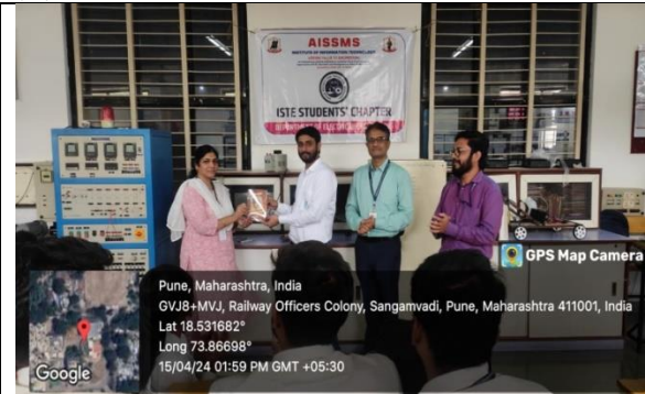
Project Competition 15/04/2024