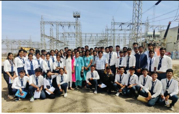
Industrial Visit to Jejuri Substation – SYBTECH