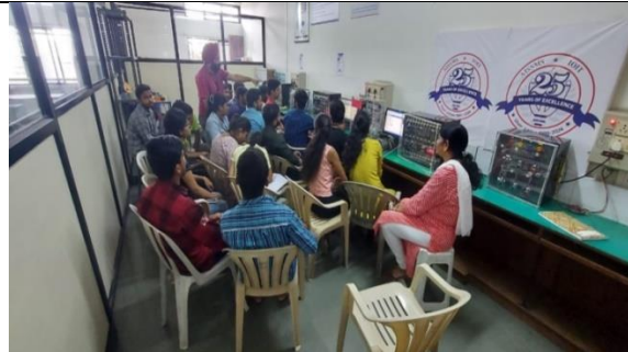
Session during the PLC AND SCADA workshop 10/10/2023 to 14/10/2023