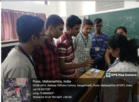
ELECTRO FUNDA 25/04/2024