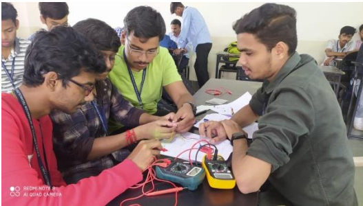
Hands on Workshop on Component identification and testing for SY Electrical on 4/11/2023 and 5/11/ 2023