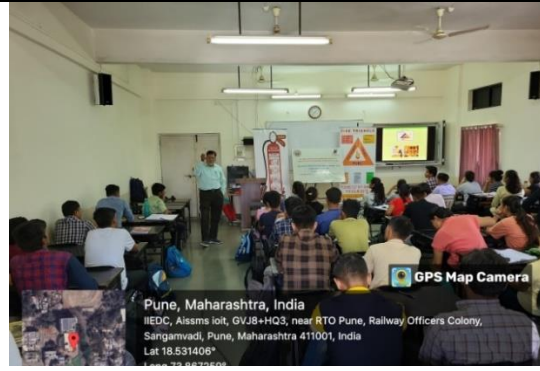
Expert lecture on Electrical Safety