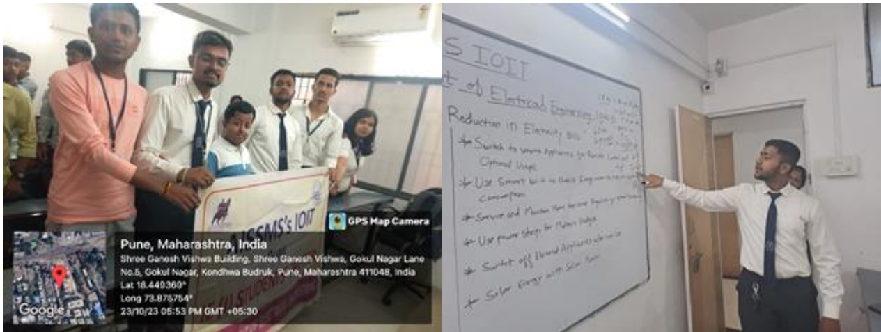
Group 2. Activity for Ways for Reduction in Domestic Electricity Bills