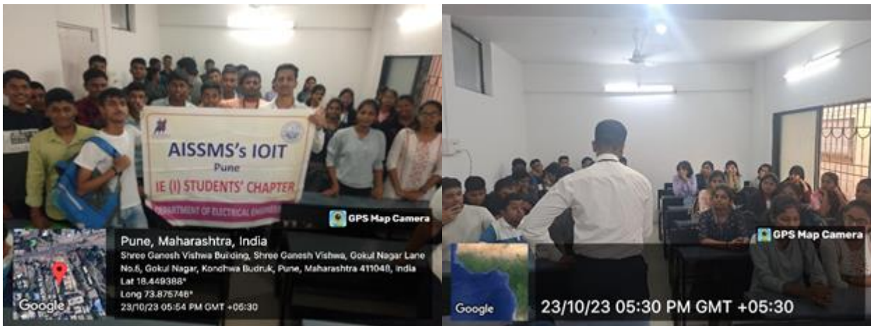
Group 5. Activity at coaching classes for Electrical Safety for Kids