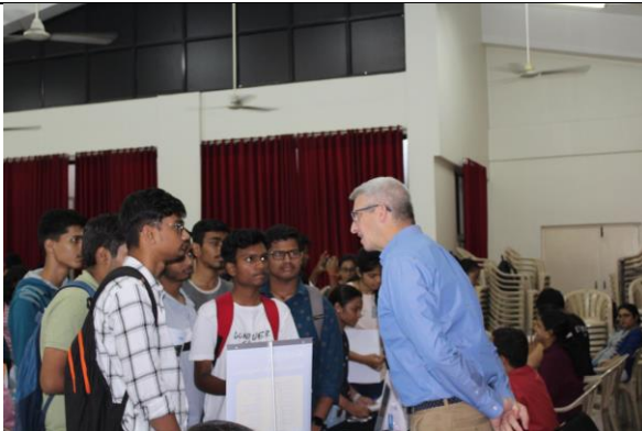
Representative of Kettering University understood requirements of our students