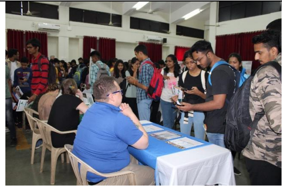
Students being guided by representative of Dallas Baptist University