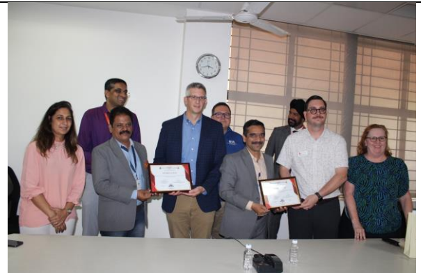
Letter of intent signed with Kettering University and with University of South Dakota