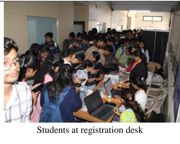
Students at registration desk