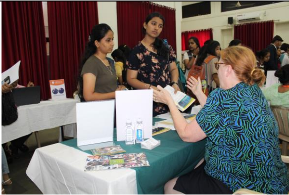
Students being guided by representative of Central Michigan University