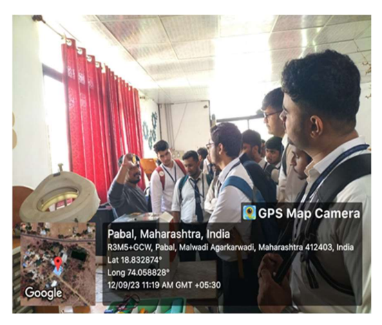
Industrial visit of TE class to Vigyan Ashram, Pabal dated 12/09/2023