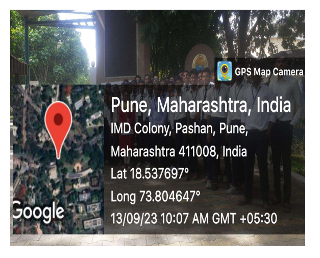
Industrial visit of S.Y class to Indian Institute of Tropical Meteorology(IITM),dated 13/09/2023