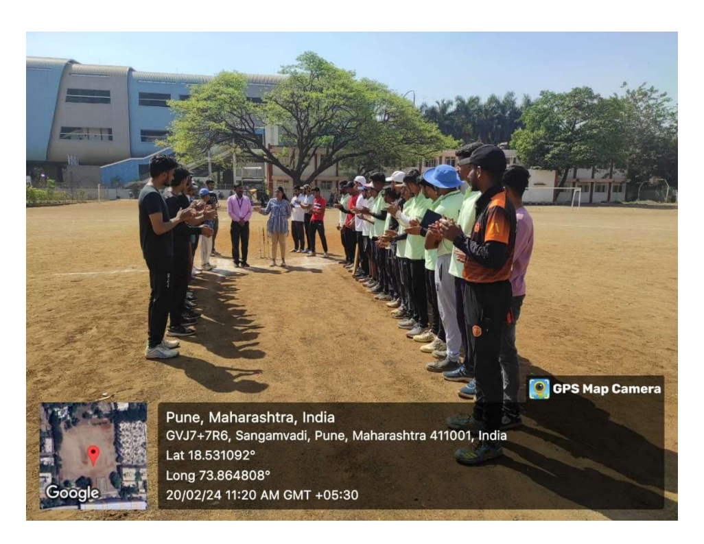
"AISA Cricket team" in Interdepartmental tournaments finals, organised on "20/02/24"