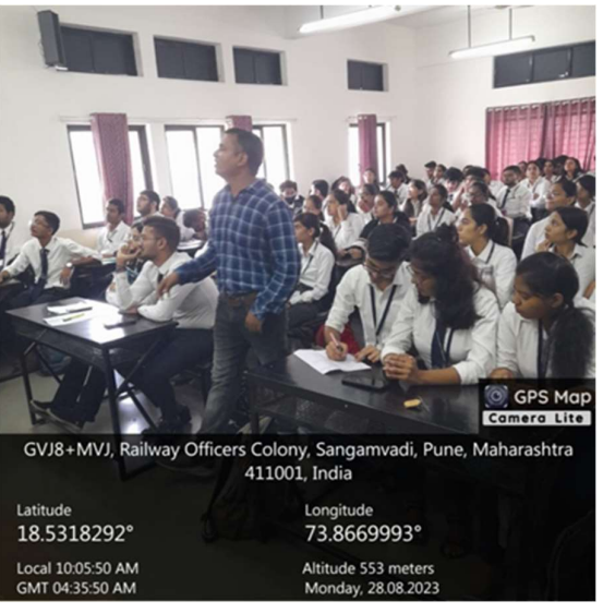
Event on "Robotic Process Automation" conducted dated 28/08/2023 by ISTE