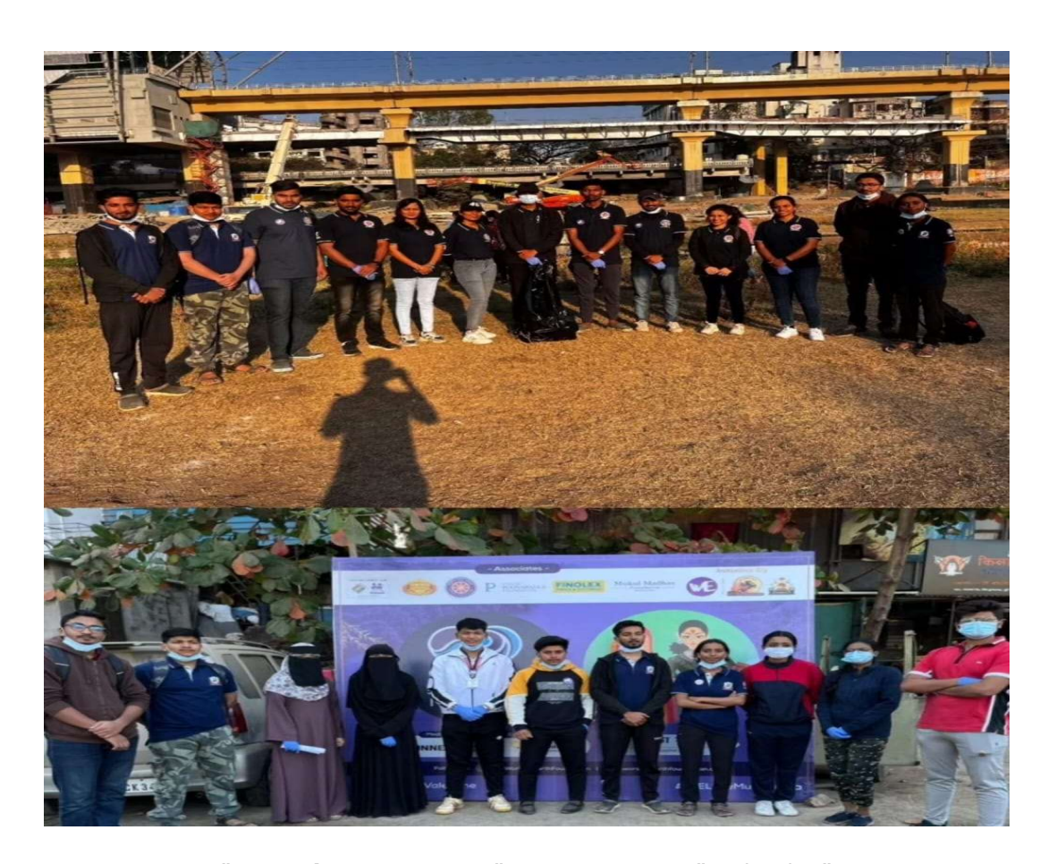
"River Cleaning Activity" By NSS team on "11/02/24"