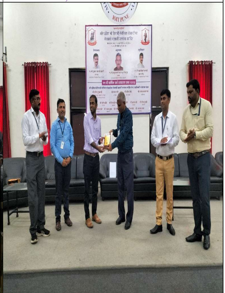
Expert Lecture on "3D Printing Technology" on 23/06/2023.