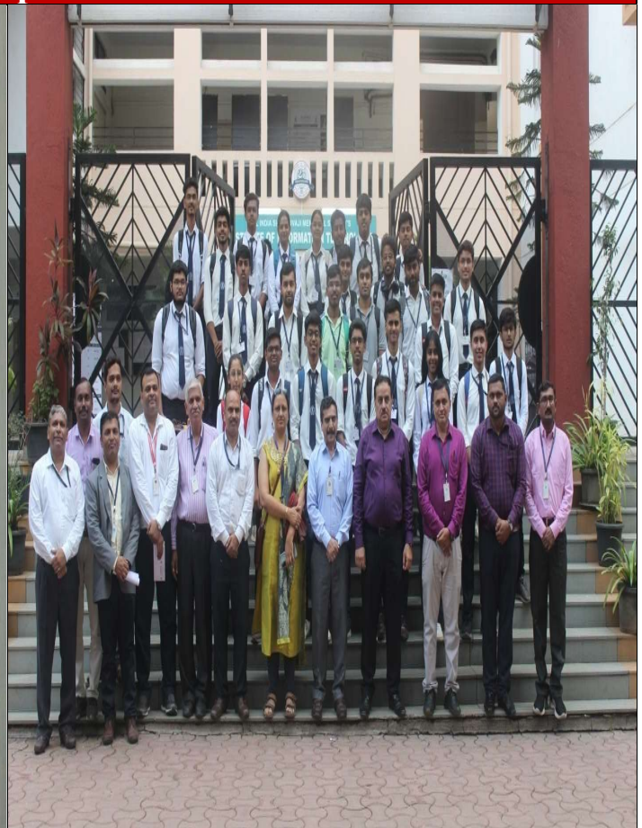
"Group photo with the winners" 14 th July 2023.