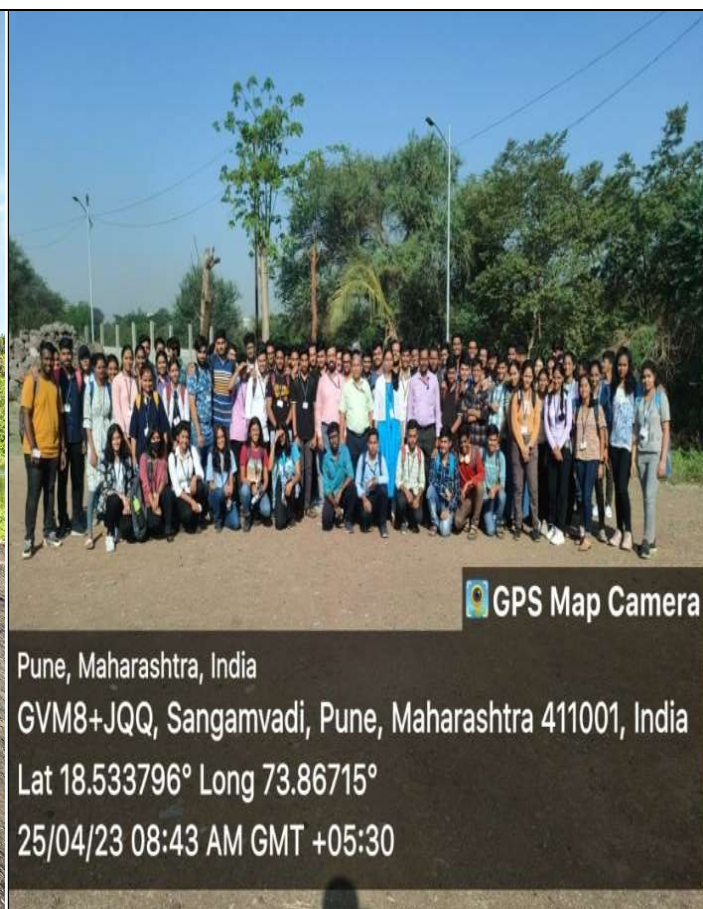
Visit to the polluted site was organized for FYBTech students under the Environmental Informatics subject of 2 nd Semester of FY B.Tech.