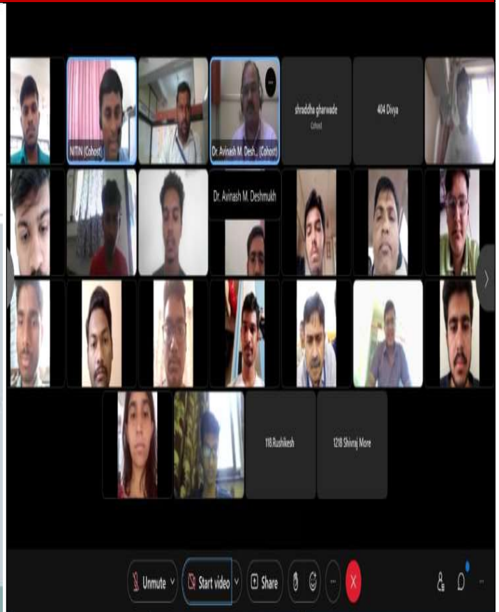
Expert Lecture on "Importance of Engineering Graphics and CAD in Industry" on 04/02/2023