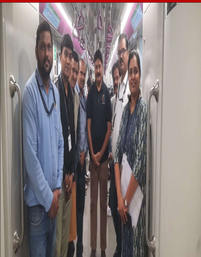
Visit to MAHA-METRO Pune on 28/11/2022.