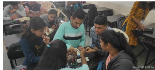
Hands on Workshop on Component identification and testing for SE Electrical on 3/12/2022 and 04/12/2022