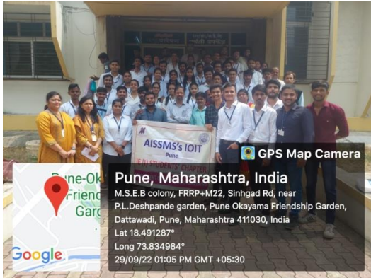
Industrial Visit to 220 KV Parvati Substation on 29/09/2022