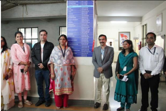
Inaguration of Enthusia 2022