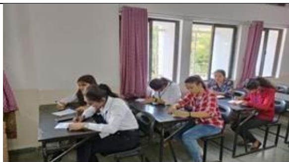
Participants while writing the memorized images and words shown to them