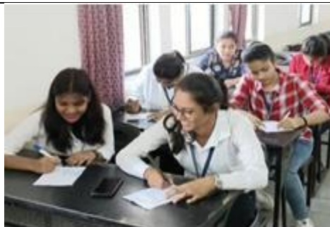
Participants enjoying the game while writing memorized words.