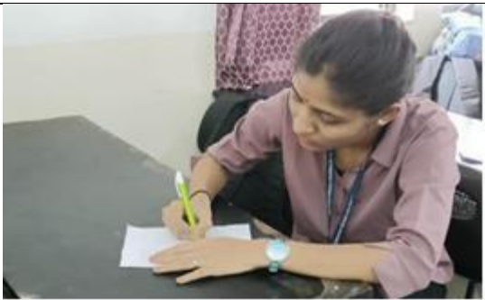
Winner of the memory testing from 4 th year (BE)