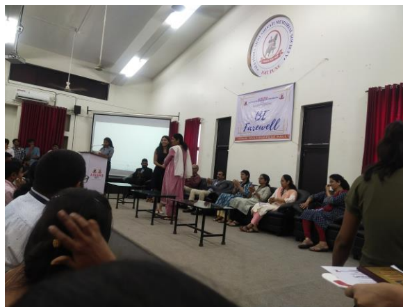
Students receiving prize for being subject topper