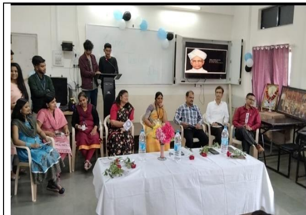
The teacher's playing the 'Yes or No' game