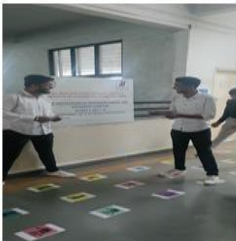
Participants while playing the HOPSCOTCH game