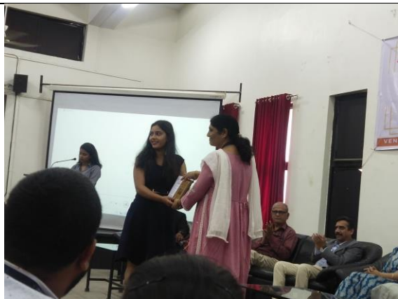
Students receiving prize for being subject topper