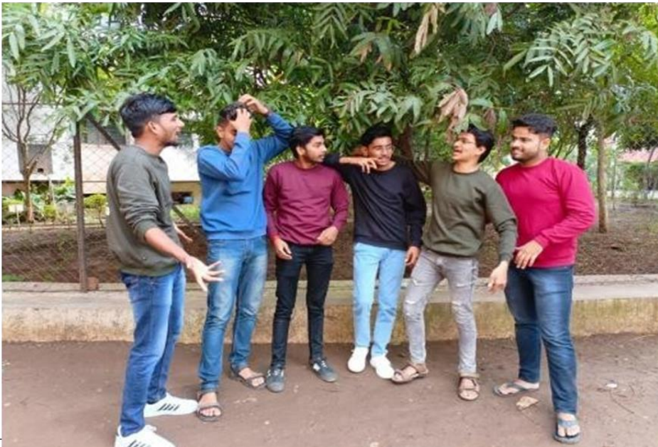
Participants enjoying games