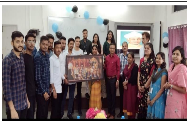
The students offering a gift to the teaching and non-teaching staff