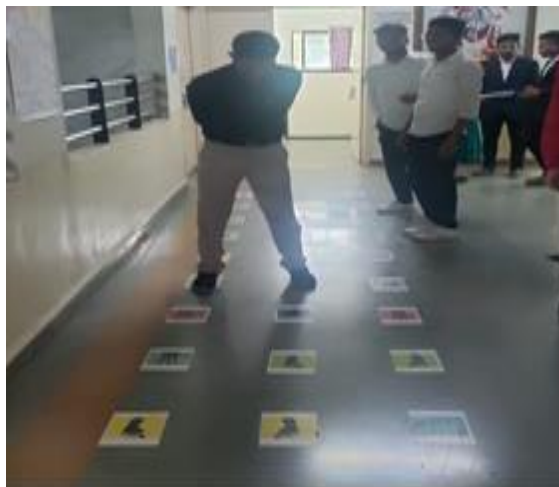
Faculty member also played this game