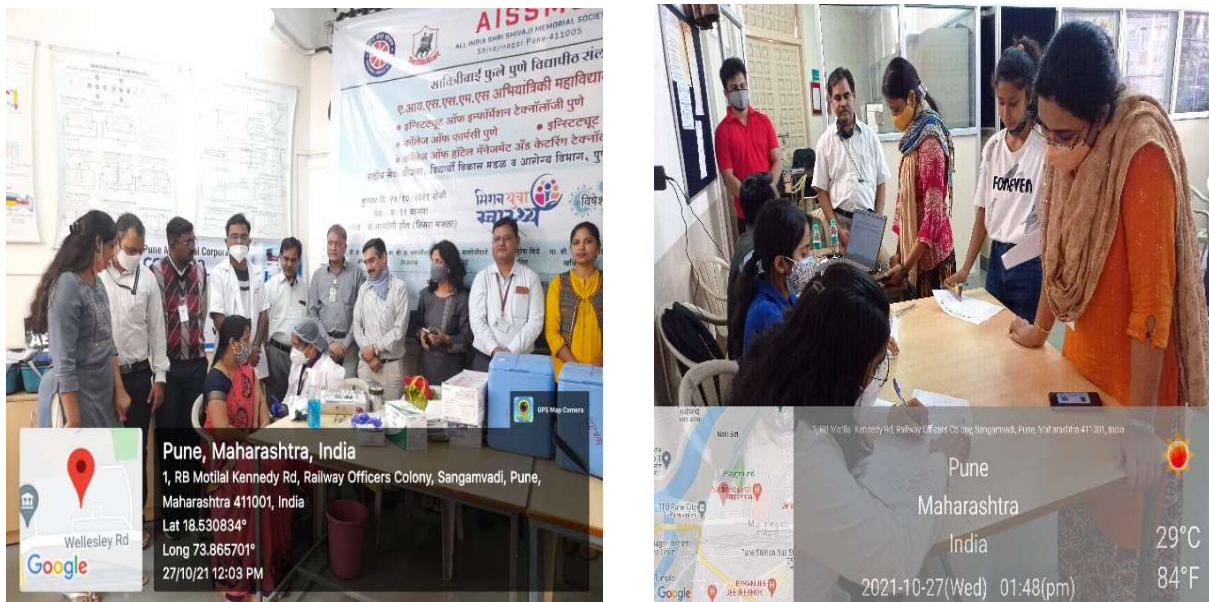
Glimpse of vaccination drive

Students and Staff members were informed that a free vaccination drive was arranged in AISSMS Campus on 27/10/2021, from 10am to 5pm. It was mandatory for all those students and staff who have not yet taken even single dose or have taken only single dose of vaccination and were eligible for vaccination. Event was coordinated by SDO and NSS of AISSMS Institutes. Principal Dr. P. B. Mane guided for this activity. 40 students and staff eligible for vaccination dose participated in this activity.