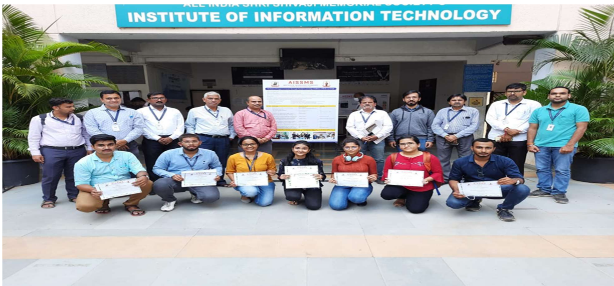
Felicitation of award-winning students who participated in various competitions under T.E.S.L.A. during AY 2020-21