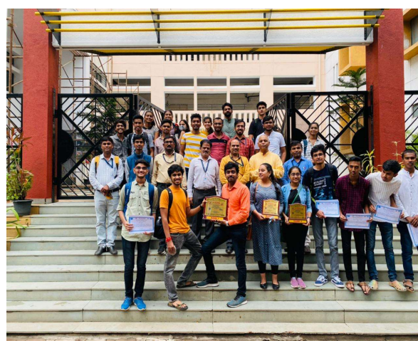
National Level Mini Project Competition Winners with Chief Guest and Organizers