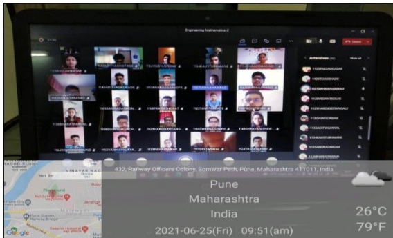
Plastic Ban Activity: 25/06/2021 GFM took pledge with students in online

motivated and guide to this activity and coordinated by SDO and Mr.S.R.Kokane.