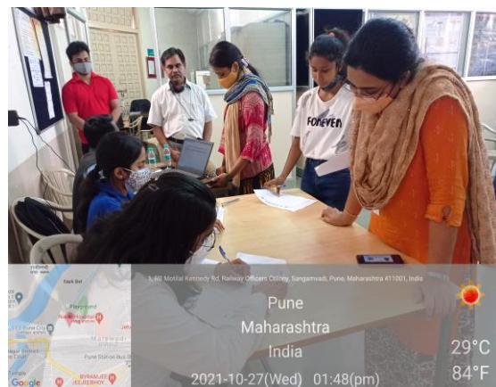
Vaccination Drive registration cell