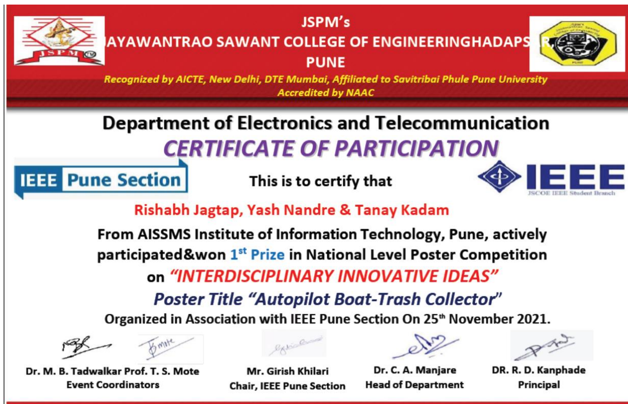
Student's Achievement in poster competition