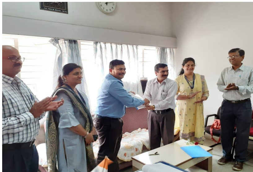
BSNL MOU 10/02/2020