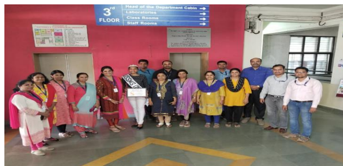
Women's Day 08/03/2020