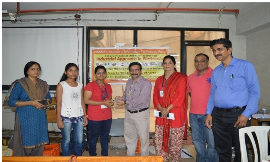
Workshop on industrial Approach in Electronics. Date:19/08/2019-21/08/2019, Class: SE(A, B, D )