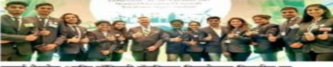
स्मार्ट हेल्मेट आणि सॅनिटरी नॅपकिन्स डिस्पोजल सिस्टीम या प्रकल्पांनी आंतरराष्ट्रीय स्पर्धेत दोन पारितोषिके पटकावली.