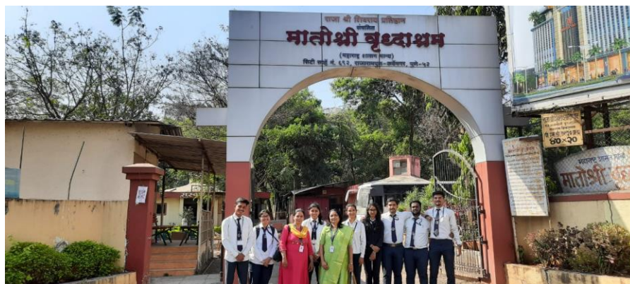
Social Visit: Matoshree Vruddhashram Date: 24/01/2020; Class: TE (B)