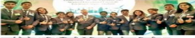
स्मार्ट हेल्मेट आणि सॉनेटरी नॅपकिनस डिस्पोजल सिस्टीम या प्रकल्पांनी आंतरराष्ट्रीय स्पर्धेत दोन पारितोषिके पटकावली.