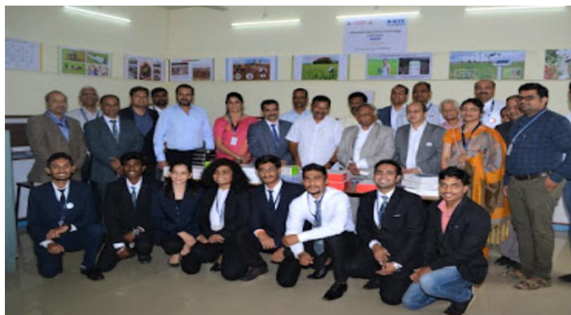
Dr.Vijay Bhatkar visit to Agri-lab on 12/02/2020