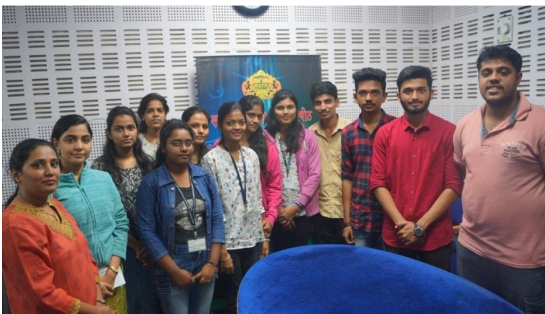
Visit at Vidyavani.Pune