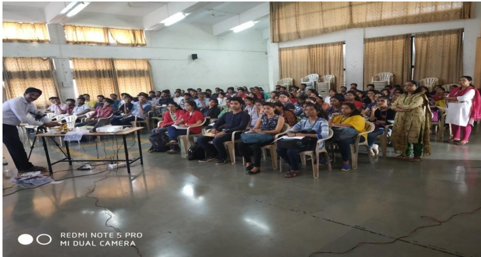
Seminar on Need of Electronics in Industry. Date:05/07/2019, Class: SE(A, B, C, D )