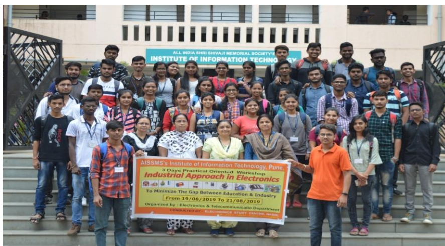
Workshop on industrial Approach in Electronics. Date:19/08/2019-21/08/2019, Class: SE(A, B, D )