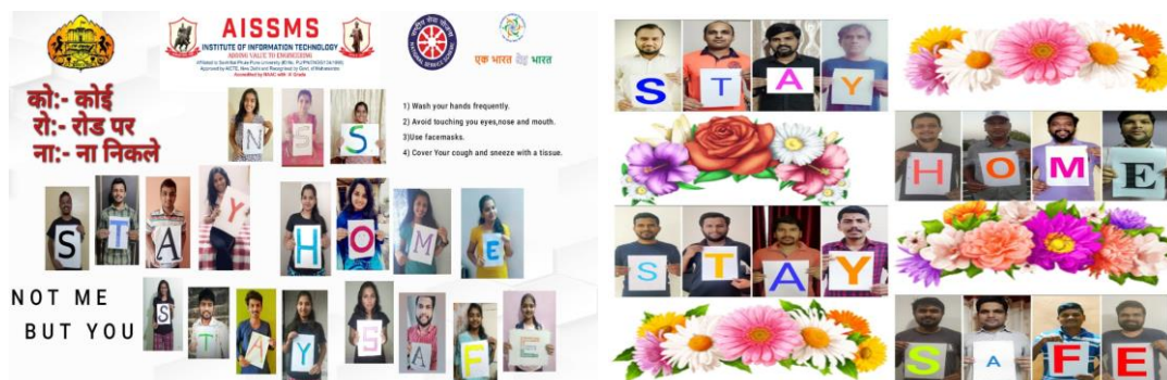
Covid19 awareness Poster by staff and students.