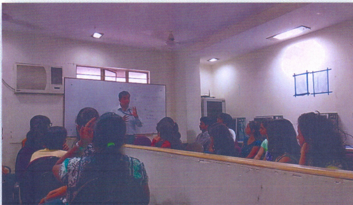
Industrial visit to CMC Pune Pune on 16/09/2015 organized by S.P.Pimpalkar for BE comm (shift II)