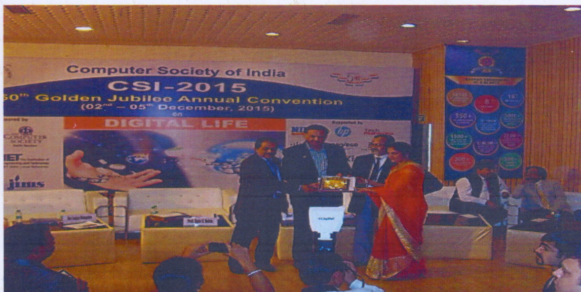
Best Accredited Students Branch Award, Bharti Vidyapeeth , New Delhi