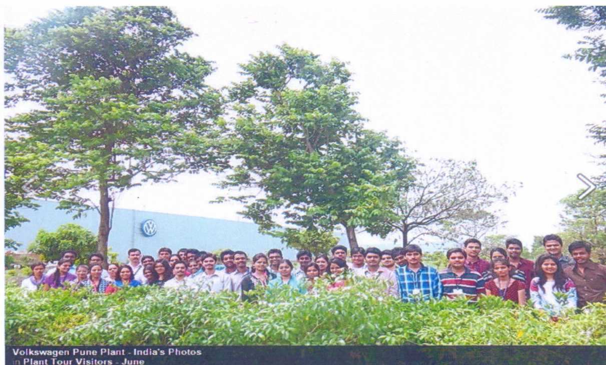
Volkswagen Pune Plant - India's Photos in Plant Tour Visitors - June