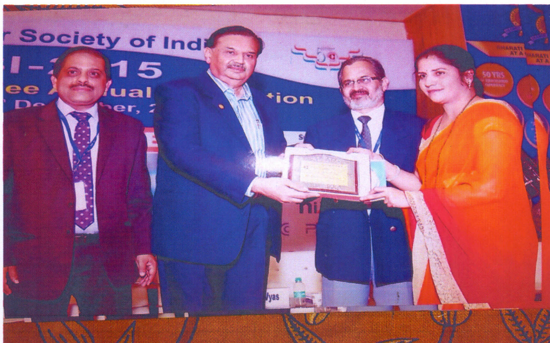
Longest Continuous SBC Award, Bharti Vidyapeeth , New Delhi