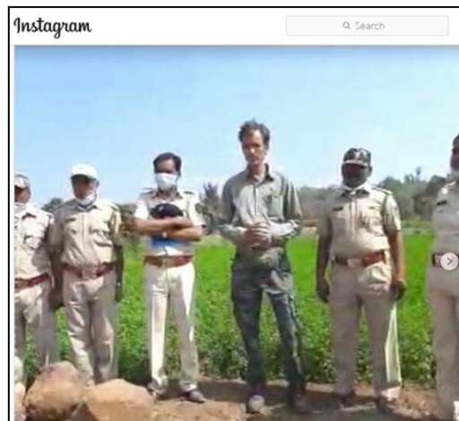
Media Coverage: Environmental studies virtual visit posted on Instagram