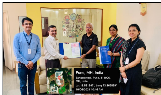
MOU with SAS PowerTech Pvt. Ltd.