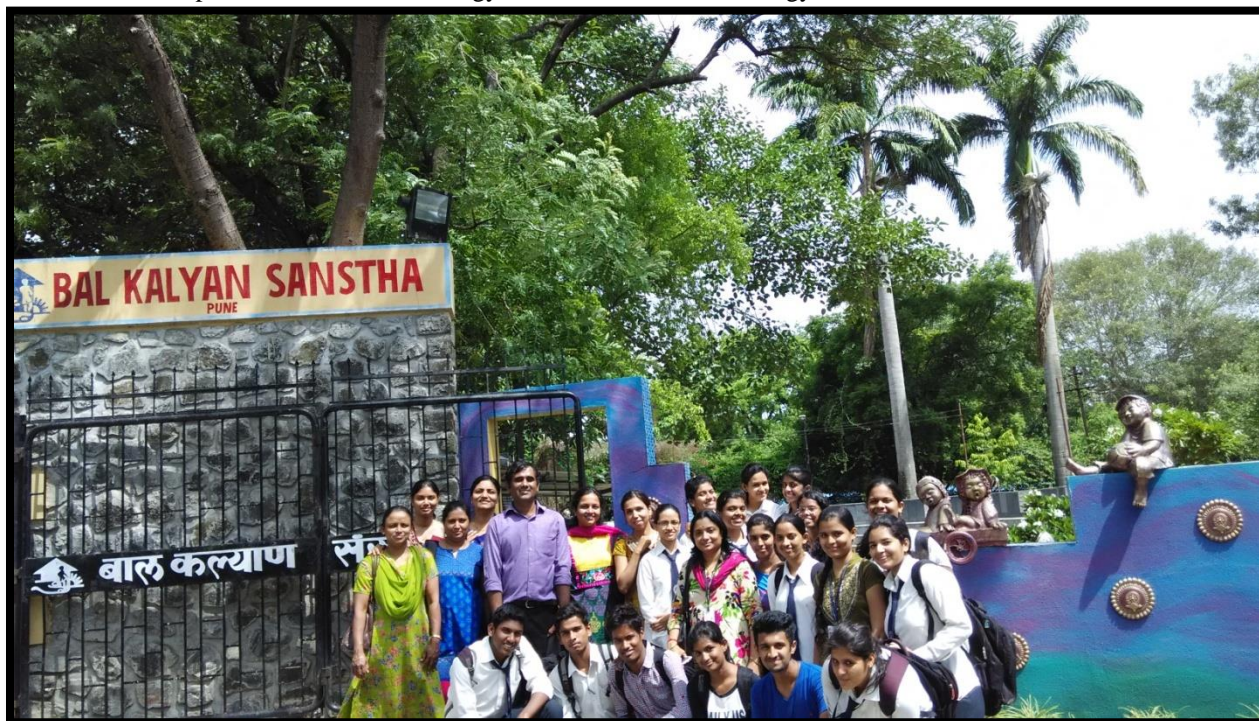
Social Visit to Balkalyan Sanstha on 9/7/15