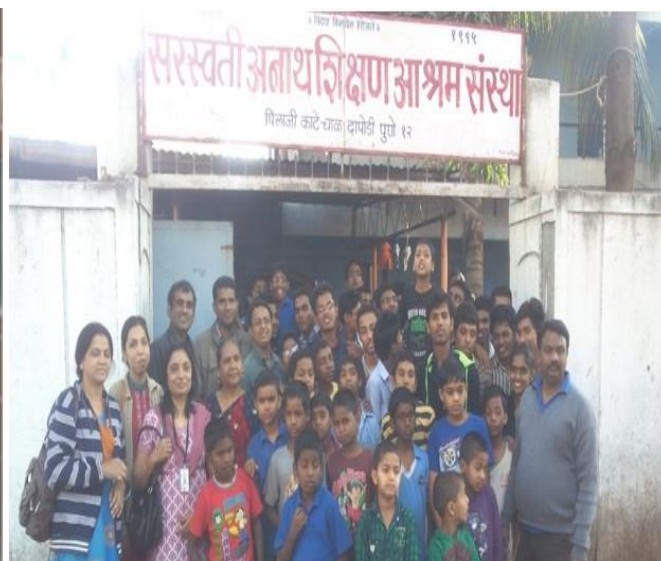
Social Visit ToSaraswatiAnathShikshan Ashram