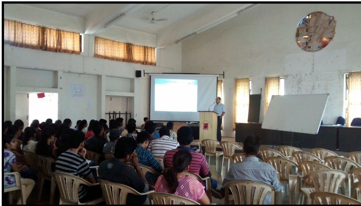
Expert Lecture on Technology Trends in Video Technology for BE Students on 20/08/15