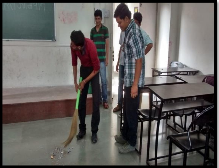
Social Event “Swaccha Bharat Abhiyaan” on 01/10/15 in BE(A & B Div) Class in E&TC Department