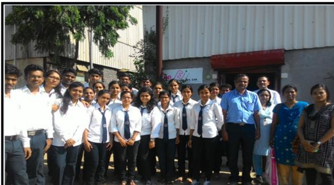
Industrial Visit At R.D. Electronics Pvt Ltd, Tathawade on 07/09/15 with BE(B)