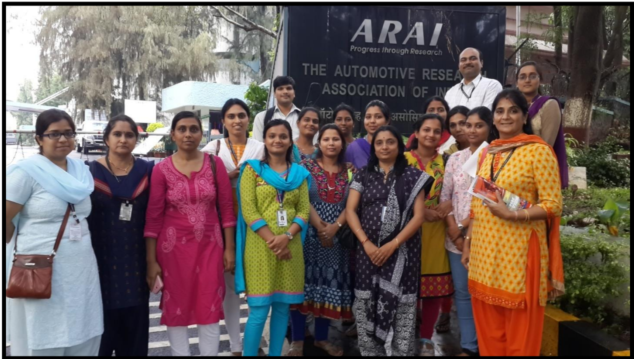
Industrial Visit to “ ARAI industry” on 10/10/15