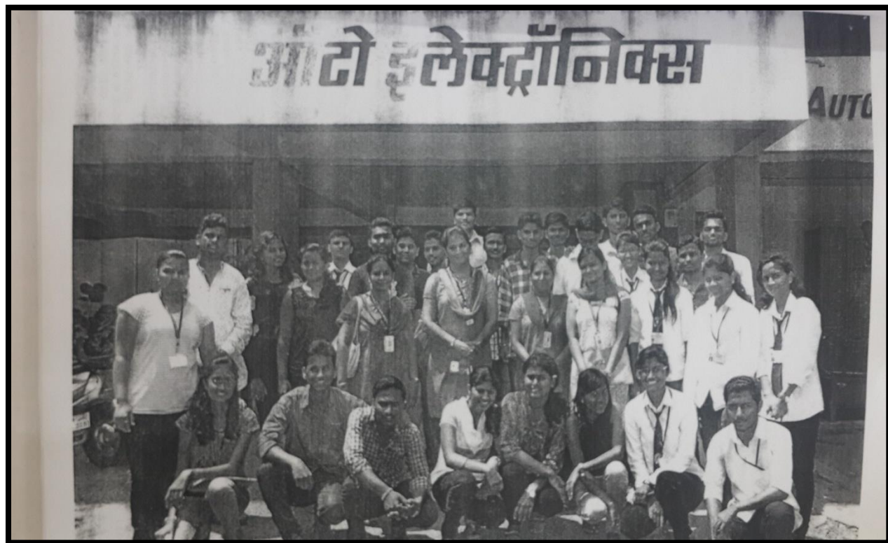
Industrial visit at Auto Electronics, Singhgad Road,Pune for TE (E&TC-C Div.) Engineering on 01/10/15