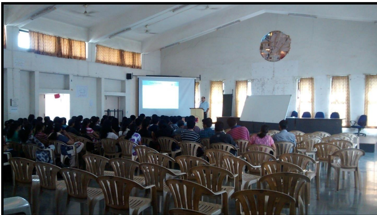
Two days seminar on “introduction to C Language” for SE on 07/07/15