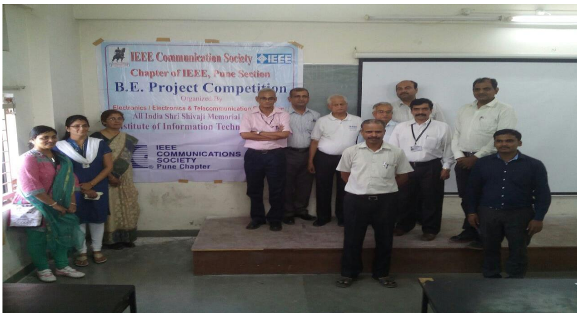
B.E .Project Competition

A two days student workshop on Embedded Processors was held on 4th and 5th of March 2015. The workshop was guided by the EduTech Systems, Baroda .The workshop was supported by ISTE, New Delhi