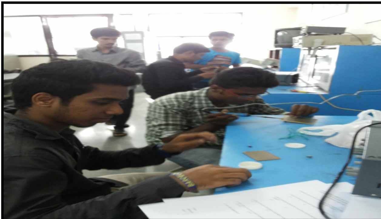
A one day IETE workshop on “Instrument Handling And Circuit Mounting”, supported by Indian Society for Technical Education, New Delhi held on 18 th to 20 th June 15 at AISSMS, IOIT, Pune.