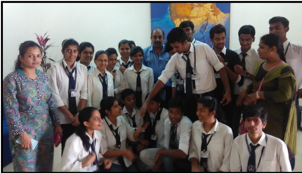
Industrial Visit of SE (B) to “Finolex Pvt Ltd” on 10/09/15