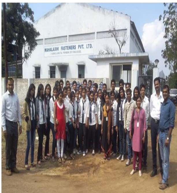
Industrial Visit to MAHALAXMI FASTENERS