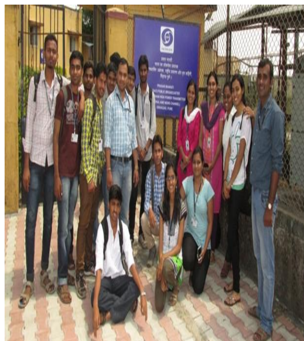
Industrial visit to Door Darshan Kendra- Transmitter Station ,Sinhgad Pune