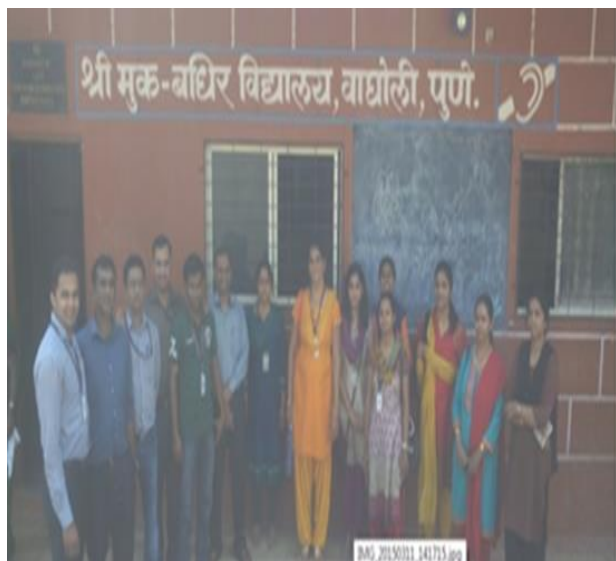
Social Visit to MukbadhirVidyalaya(11/02/2015), Wagholi