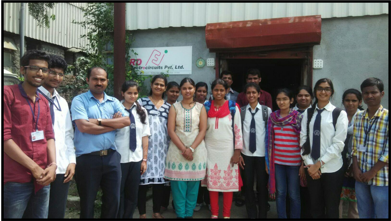
Industrial Visit At R.D. Electronics Pvt Ltd, Tathawade on 15/09/15 with BE(A)