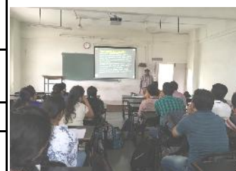
FACULTY VISIT AT YANTRA HARVEST