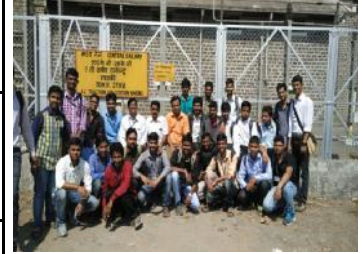
TE Visit to Central Railway TSS Kirkee Loco workshop.