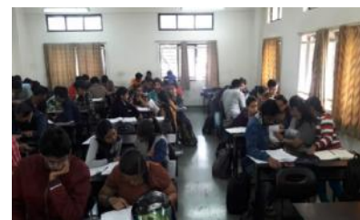
HV Engineering- Group Discussion & Presentation