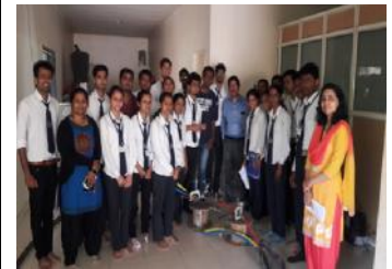
Cable testing being shown at MAHADISCOM Testing and Quality Assessment Laboratory (Major Stores A&B) Phursungi, Pune