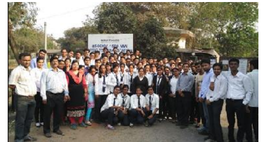
TE Visit to HVDC substation Padghe.