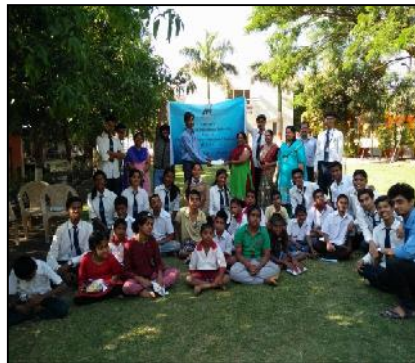
Social Activity –Visit to Nivasi Apang Vidyalaya , Nigdi