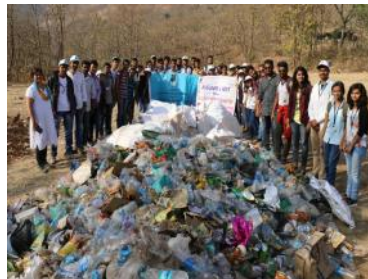
SINHGAD SWACHHATA MOHIM