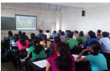
Video of Oil Filtration Process shown in TE class