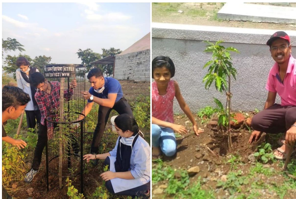
Tree Plantation Activity at Home 27/06/2020