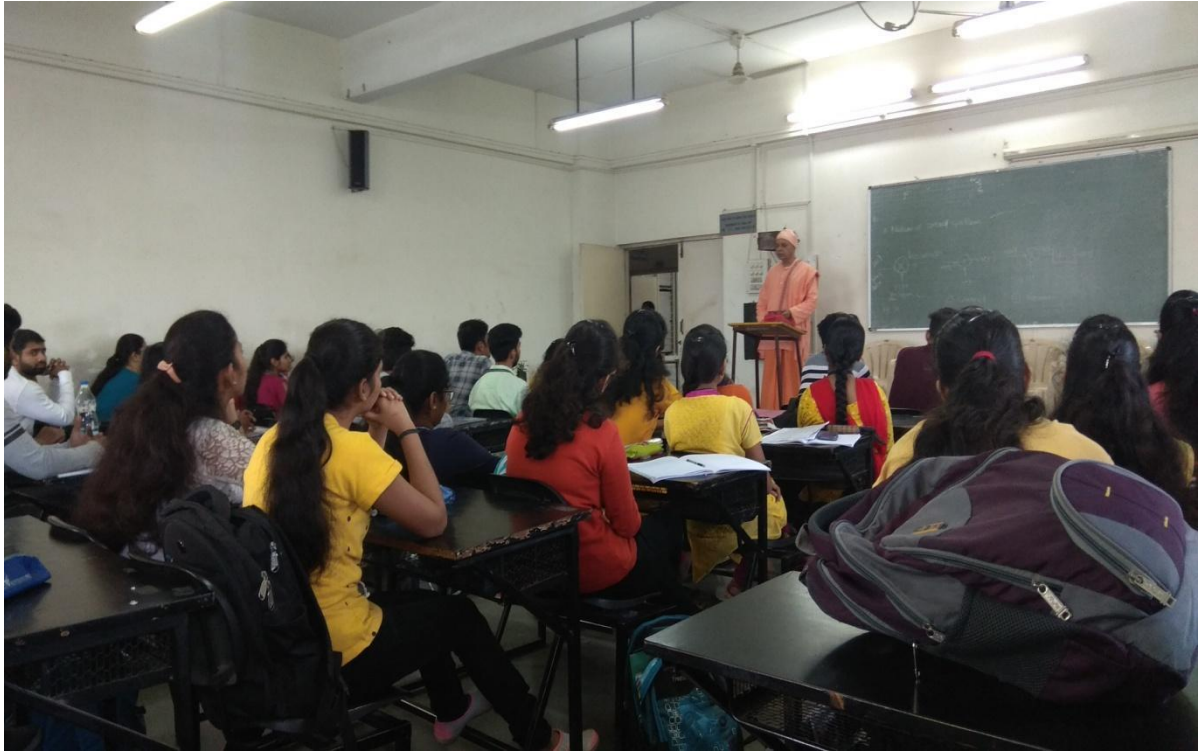
Speech on Swami Vivekanand by Ramkrishna Math, Pune on 03/10/2019