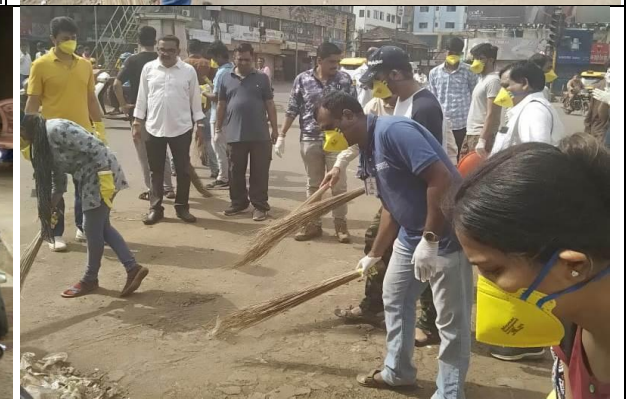
Kolhapur Flood Relief Activities 18/-8/2019 to 21/08/2019