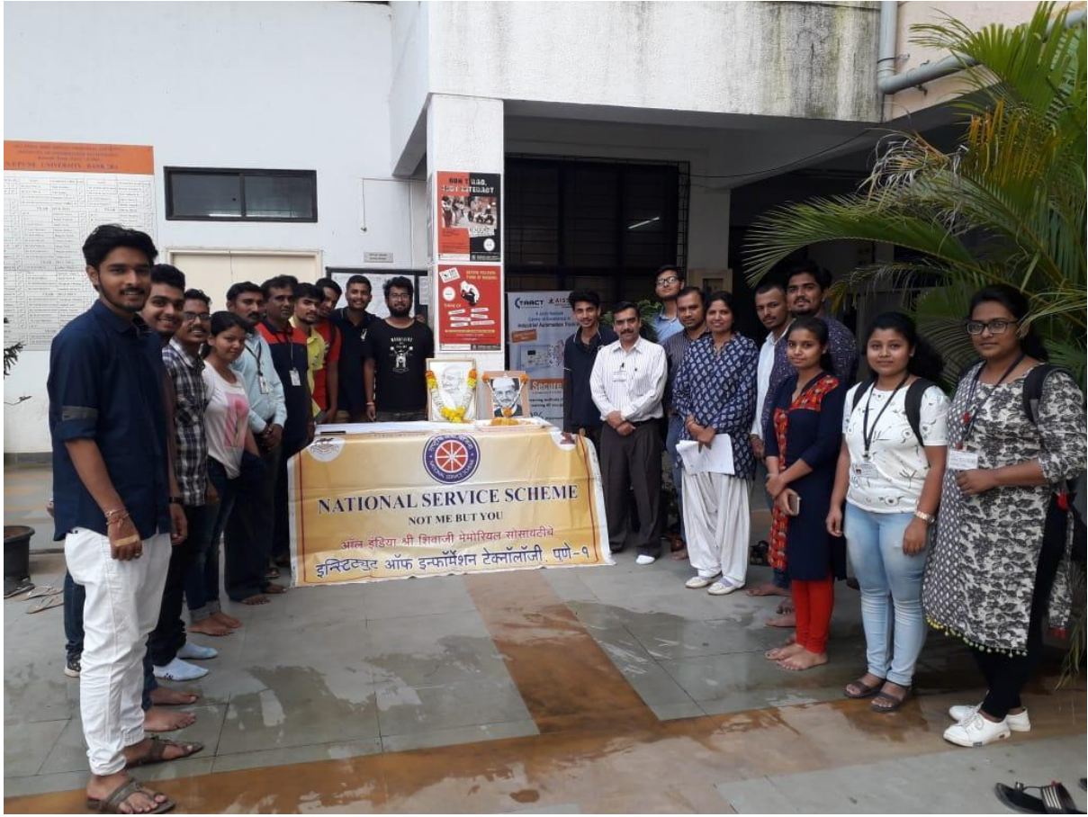
Mahatma Gandhi and Lal Bahaddur Shastri Jayanti 02/10/2019