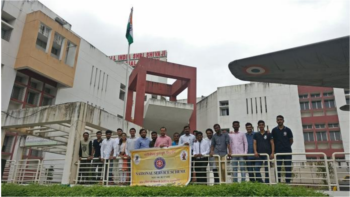
Independence Day 15/08/2019