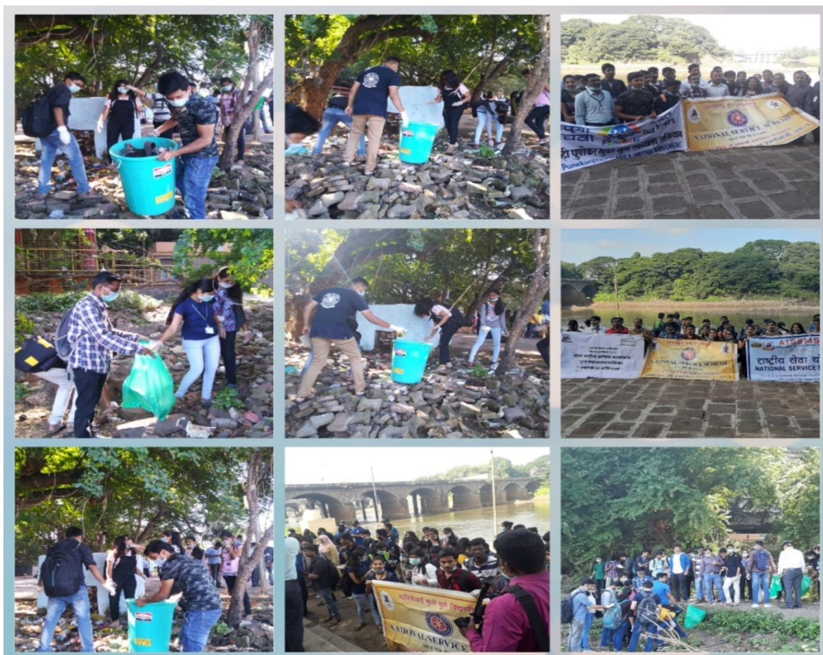
Cleaning Activity At Sangam Bridge 02/10/2019

Considering the importance of cleanliness in our daily life and the adverse effects of unhygienic conditions on human health, All India Shri Shivaji Memorial Society, Institute of Information Technology, Pune College is organizing various activities under the Clean and Healthy India Campaign Fortnight of National Service Scheme.