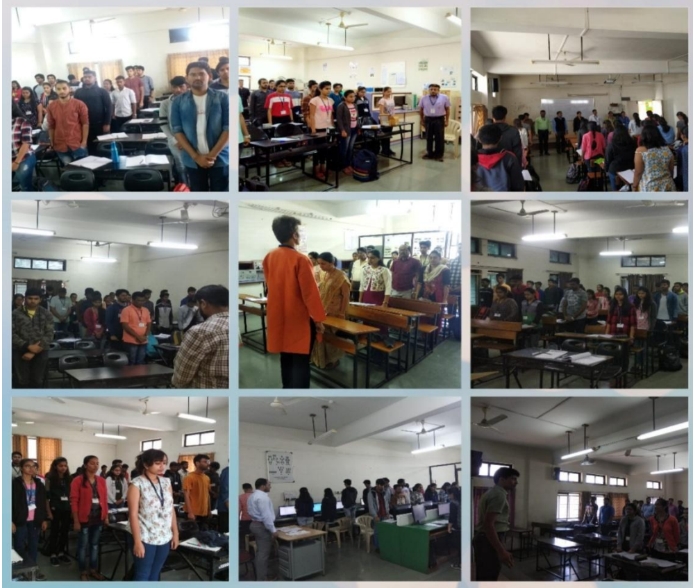
Hutatma Din on 30/01/2020