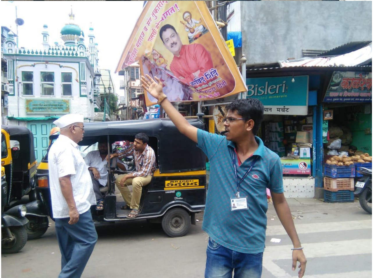
Street Play and Traffic Control Activity in Pandharpur Wari 27/06/2019 and 28/06/2019