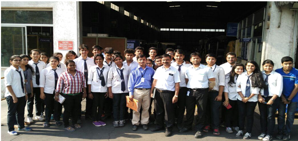
Industrial visit at SANSERA ENGINEERING PVT LTD, Chakan, Pune