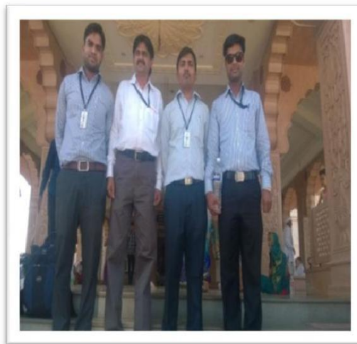
Social visit organized for staff & students At GATHAMANDIR,DEHU