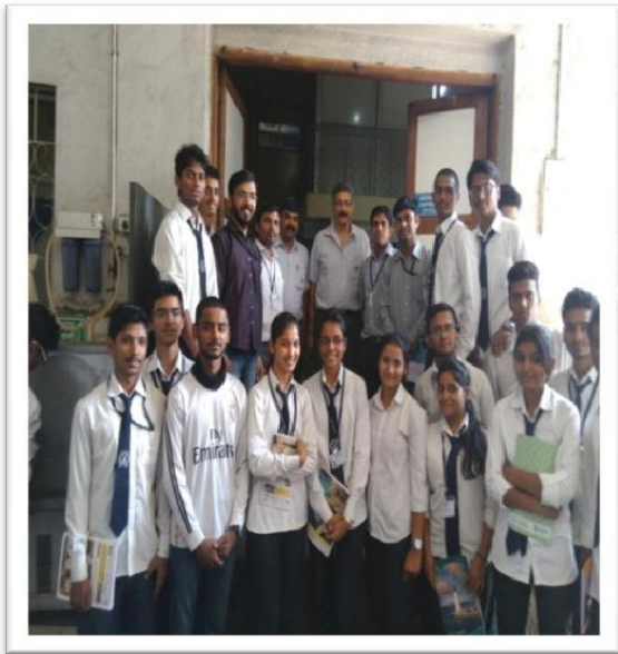
Industrial visit at KAP Engineering Pvt.Ltd. Bhosari pune