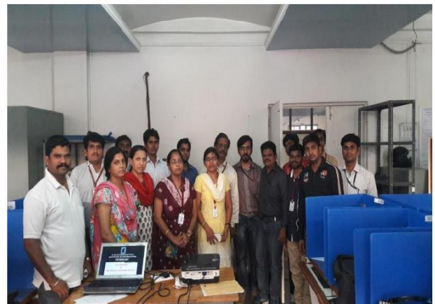
"Two Days Workshop on MS Office and Open Office" for Non Teaching Staff Members, 16 th and 17 th February 2016