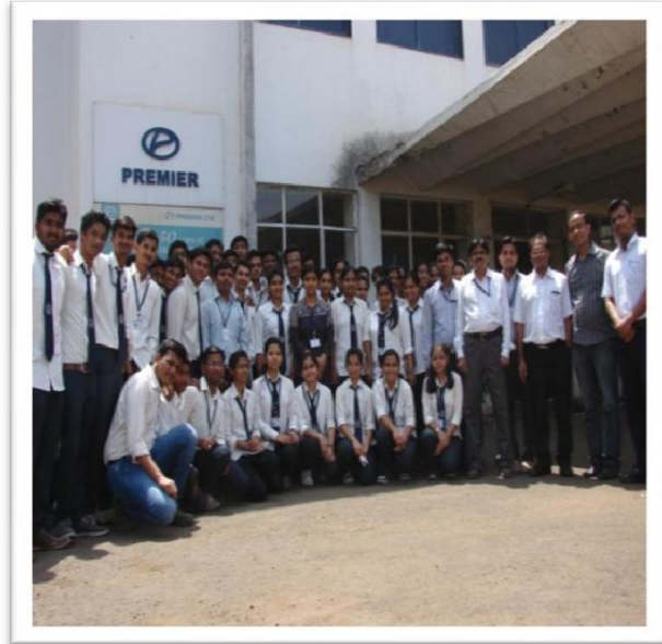
Industrial visit at Premier Ltd Chinchawad, Pune