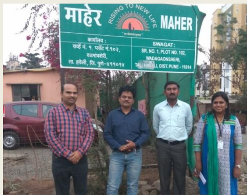
A Social Visit to Maher Ashram by F.E. Staff