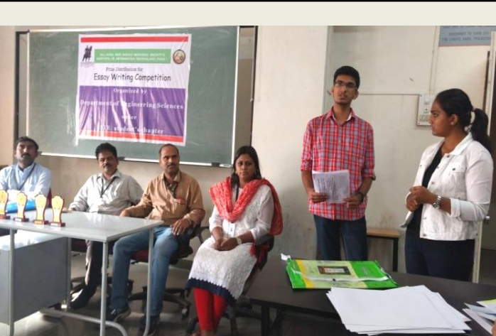
Prize Distribution ceremony of the Essay Competition organized under ISTE students chapter.