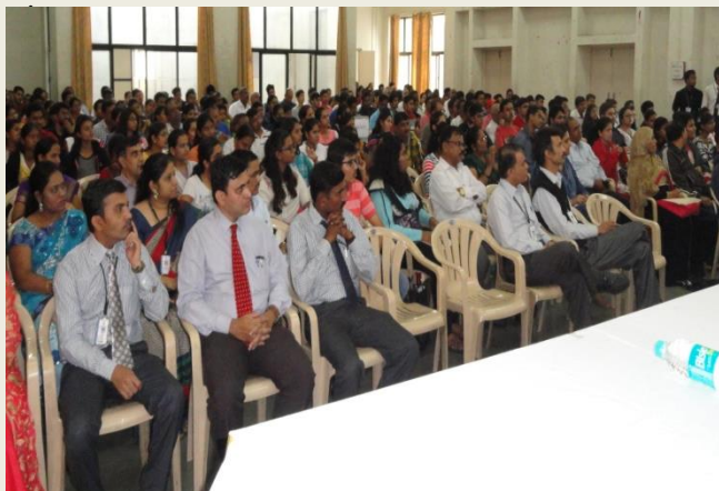
Parents of newly admitted students attending the induction day program.