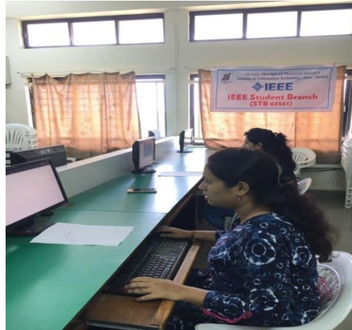
C Code Generation