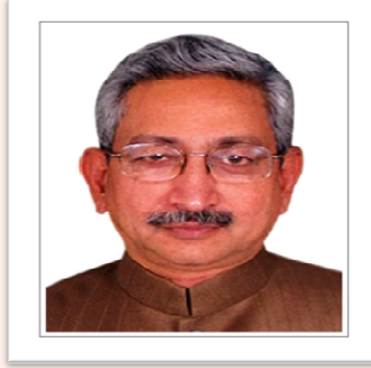
Shri Shahu Chhatrapati, Kolhapur President, AISSM Society