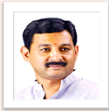
Shri Yuraj Sambhaji Chhatrapati Kolhapur, Vice-President, AISSM Society