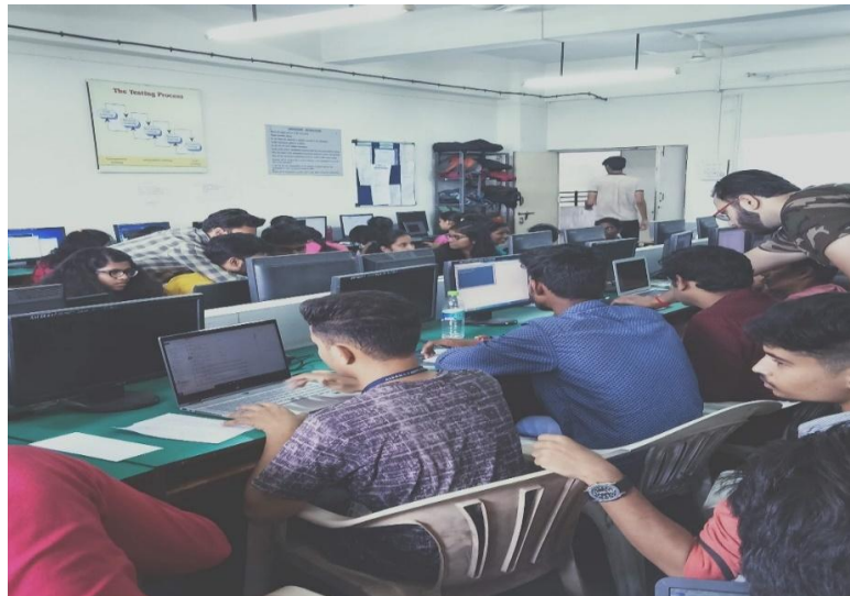
5 Days workshop on "Python Programming" conducted in collaboration with Prank -i Systems Pvt. Ltd. from 26/08/2019-30/08/2019