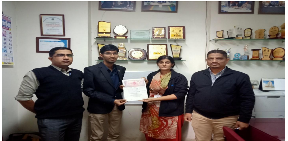
MOU signed on 26/08/2019 in between Department of Information Technology,AISSMS IOIT and Quickyes Infotech Pvt Ltd.,Pune.