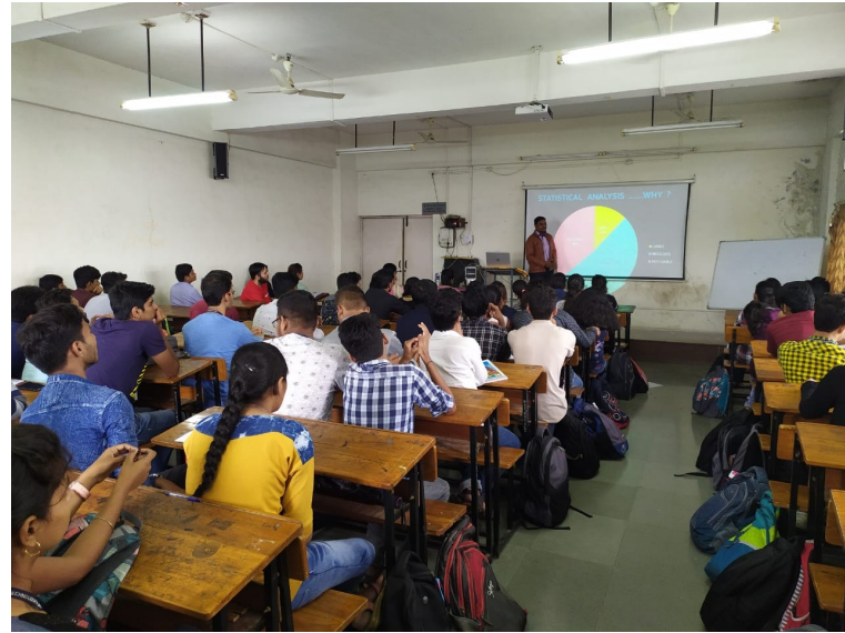
A session on the role of an engineer towards building harmonious society in IT department at AISSMS IOIT on 2/8/2019