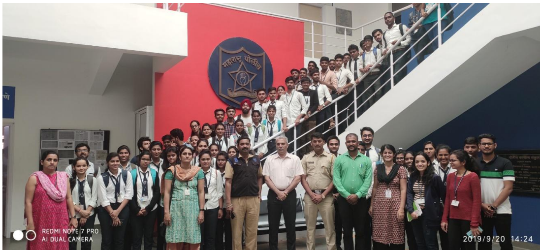
Industrial Visit at Cyber Crime Branch Pune.