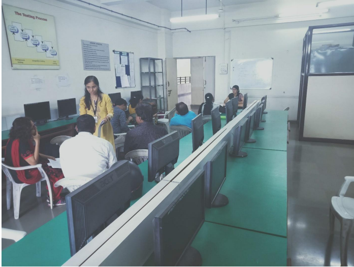
SE-IT Parent Teacher Meet conducted on 01/08/2019