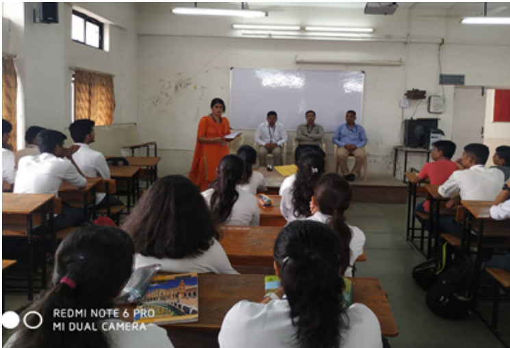
Orientation Program of SE - IT on commencement of Academic year 2019-2020