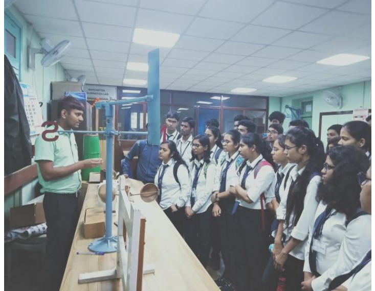
Industrial Visit of SE-IT at IMD Shivajinagar, 29/7/2019