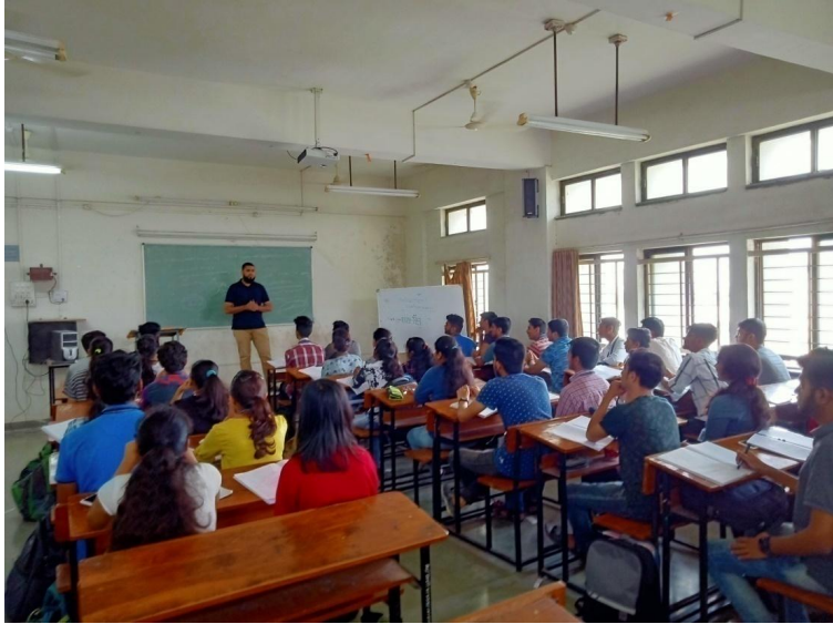
3 Days Workshop on "Programming in C++" from 19/7/2019-21/7/2019