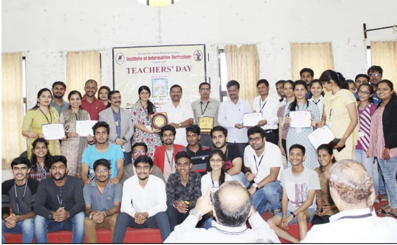
Information Technology department Received awards for the Best Department on 5/9/2019