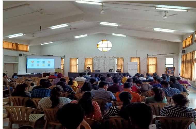
One day workshop on "We Think Digital" by Amrita Choudhury from CCAOI, Delhi on 3/10/2019