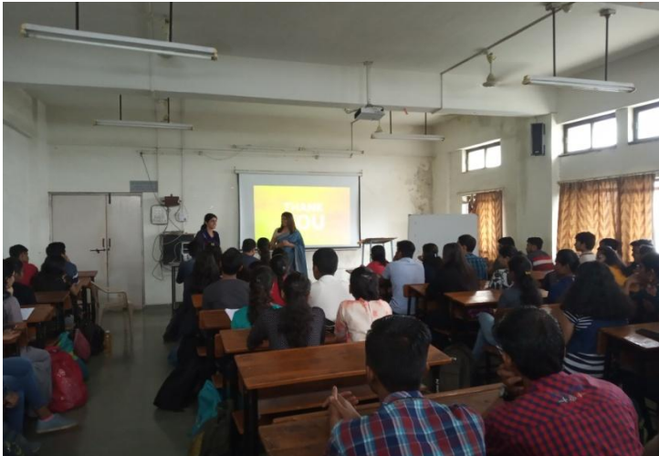
Expert Session on Digital Transformation and readiness for SE IT students on 25/09/2019