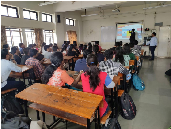
Software Testing and Introduction to Testing Automation for BE IT, 2/7/2019