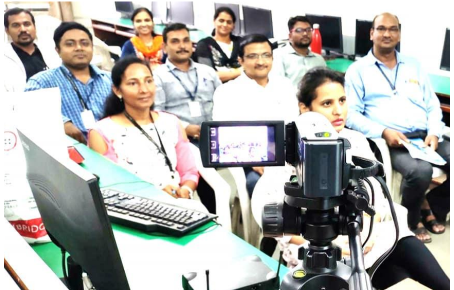
5 Days Faculty Development Program on "Network Security" in collaboration with NITTTR Kolkata is conducted from 24/6/2019 to 28/6/2019.