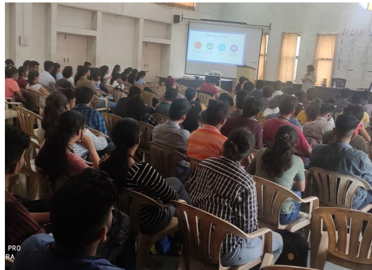
One day workshop on "We Think Digital" on 3/10/2019