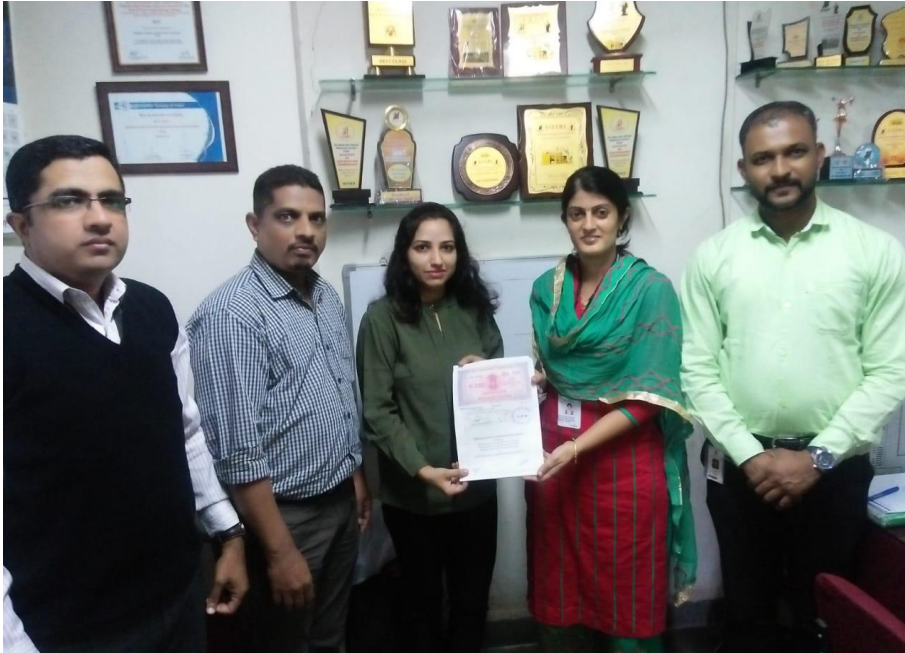
MOU signed on 19/09/2019 in between Department of Information Technology,AISSMS IOIT and HlreMindz-Signio GlobalTech Solutions PvtLtd.,Pune