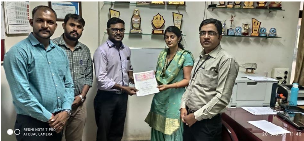
MOU signed on 30/08/2019 in between Department of Information Technology,AISSMS IOIT and Prank-I Systems Pvt. Ltd.,Pune.