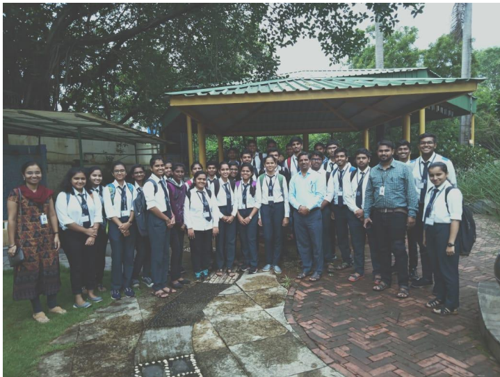
SEIT class Social Visit BalKalyanSantha,Pune on 09/08/2019