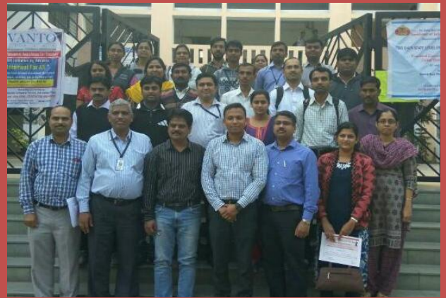
All the participants of the work shop along with the staff of F.E. Department.

Scilab is free and open source software for numerical computation providing a powerful computing environment for engineering and scientific applications. The workshop focuses on mathematical modelling using scilab. The objective is to give hands on training for developing mathematical models using Scilab. The workshop is beneficial for faculties, students get an exposure to Scilab and various tools in Scilab, which can be used for mathematical modelling.