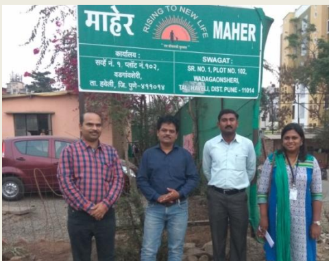
A Social Visit to Maher Ashram by F.E. Staff