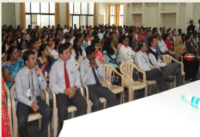
Parents of newly admitted students attending the induction day program.