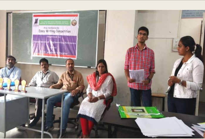
Prize Distribution ceremony of the Essay Competition organized under ISTE students chapter.