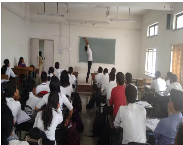
SE,TE,BE students International Yoga Day celebration