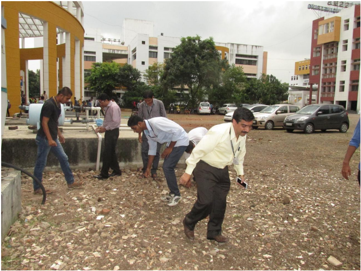
Swachha Bharat Abhiyan